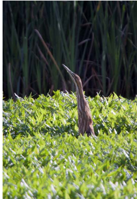
American Bittern, Chinook Mine