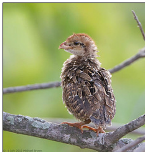
Figure 2. Juvenile Northern Bobwhite, 01 July 2012, Goose Pond, Greene.