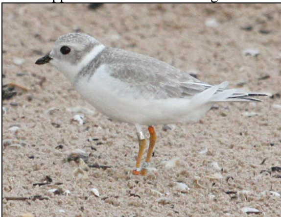
Figure 1. Banded juvenile Piping Plover, 31 July 2012, Lake.

Piping Plover Single individual observed at Miller Beach, Lake , on 7/31(John Cassady ph., Ken Brock ph.). This banded juvenile was born in the Upper Peninsula of Michigan.