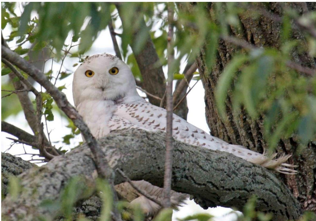
Figure 3. Snowy Owl, 12-May-2012 (top) and 15-May-2012 (bottom), Porter Co. The owl was present 08-May to 15-May-2012.