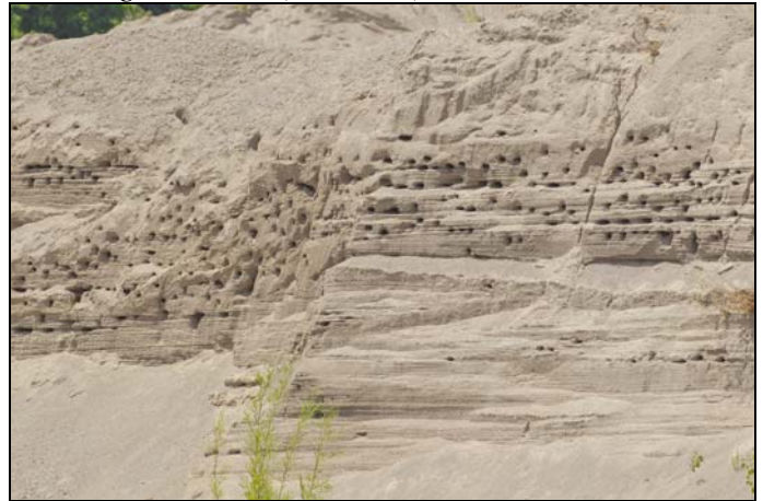
Figure 4. Historical Bank Swallow colony with 200 sites, Vermillion, 12 July 2012.

Blue-headed Vireo Single individual observed in Marshall County on 6/11(Michael Hooker). Single individual heard at Pigeon River, LaGrange , on 6/22(Jim Haw).