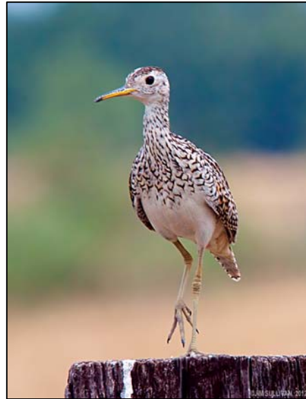
Figure 2. Upland Sandpiper, 30 June 2012, Sullivan. 6 individual observed at Universal Mine, Vermillion , on 6/13(Jeff Schaffer). 6 individuals observed at Mt. Comfort Airport, Marion , on 6/25(Clint Kiehl). 4 observed at Universal Mine, Sullivan , on 6/30(Jim Sullivan). 2 observed at Kankakee Sands, Newton , on 7/2(Jonathan Bauer). 3 observed in cornfield near Newberry, Greene , on 7/29(Vern Wilkins). Single individual reported from Cane Ridge, Gibson , on 7/29(Evan Speck).

Upland Sandpiper There were 22 reports. Single individual observed at Mt. Comfort airport, Marion , on 6/10(Bob Decker). Single