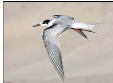
Figure 3. 1 st summer Common Tern, Miller Beach, Lake, 21 July 2012.

Common Tern 3 observed at Eagle Marsh, Allen , on 6/1(Roger Rang). Single individual observed at Miller Beach, Lake , on 7/21(Ken Brock).