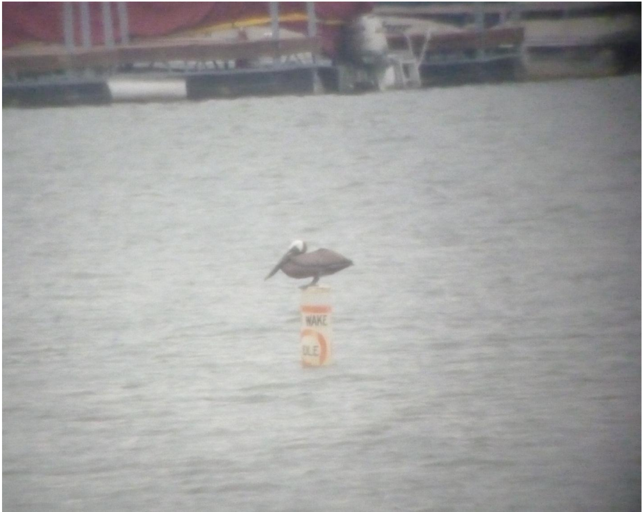
Figure 8. Brown Pelican, 12-May-2012, Orange Co.