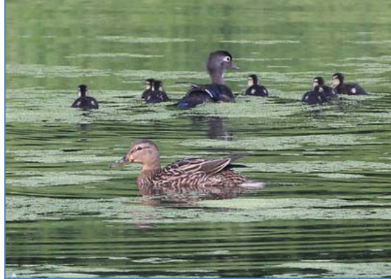
St Mary of the Woods campus: Baltimore Oriole ... Female Mallard & Wood Duck brood ... Wright Road: Purple Martins Universal mine: Eastern Meadowlark, Eastern Kingbird