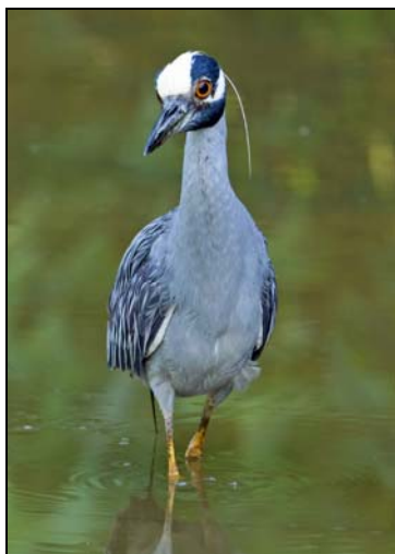
Figure 1. Yellow-crowned Night-heron. 05 Jun 2012, Patoka NWR, Gibson