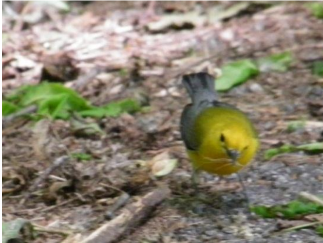
Figure 1. Prothonotary Warbler, 12-May-2012, Madison Co.

The Big May Day Bird Count was conducted state-wide on Saturday, May 12 th , 2012. The objective of the BMDBC is to count the number of birds of each species occurring in a participating county area from midnight to midnight on the second Saturday in May. The ensuing data snapshot provides a valuable scientific record of the resident and migratory bird populations occurring each year in Indiana.