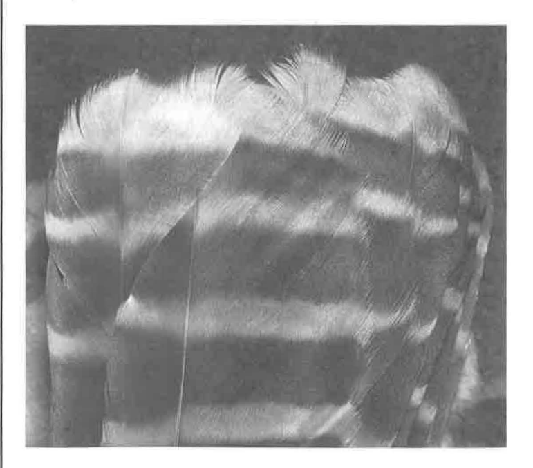
Fig. 2. Typical HY rectrices. Note the tapered white tips with no mottling. Fresh tips appear to have less barb density.