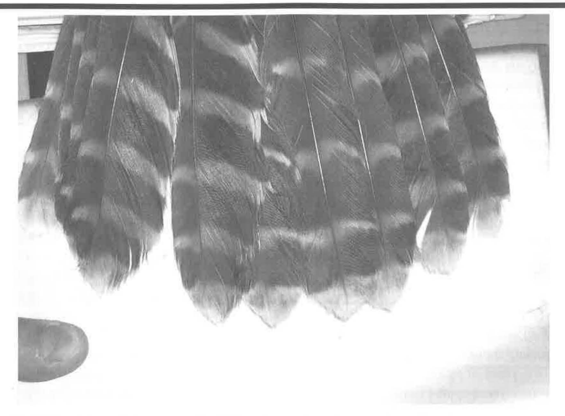
Fig 3 HY rectrices with brown mottling. Thin and tapered rectrices are other evident juvenal characteristics