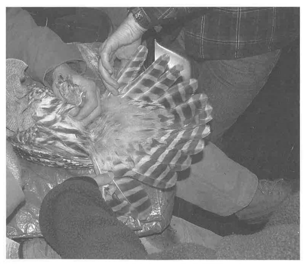
Fig 4. ASY Barred owl "Gus" with 13 rectrices, the extra on his right side.

Fig 3 HY rectrices with brown mottling. Thin and tapered rectrices are other evident juvenal characteristics