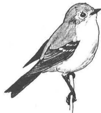
Ruby crowned Kinglet