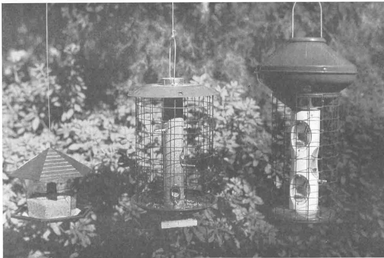
Fig. 1. Three types of feeders used in course of the annual survival study of the eastern population of the Painted Bunting: left to right: Model 3416 Gazebo, Rubbermaid (Wooster, OH); Model 1880 Selective, Duncraft (Concord, NH); and Model Avian 1, Vari-Crafts (Landing, NJ). The use of commercial products listed above does not constitute endorsement.

At each study site, feeders were mounted at the top of either 1.3 or 1.9 cm threaded pipe driven into the ground 0.3-0.5 m. A half bag of concrete mix was poured as a collar around the pipe to prevent the feeder from wobbling in the sandy soil of the Atlantic Coastal Plain. The bottoms of feeders were 1.2-1.5 m above ground. Feeders were attached to pipes by threaded flanges or nipples and couplings screwed into threaded fitting on the underside of feeders.