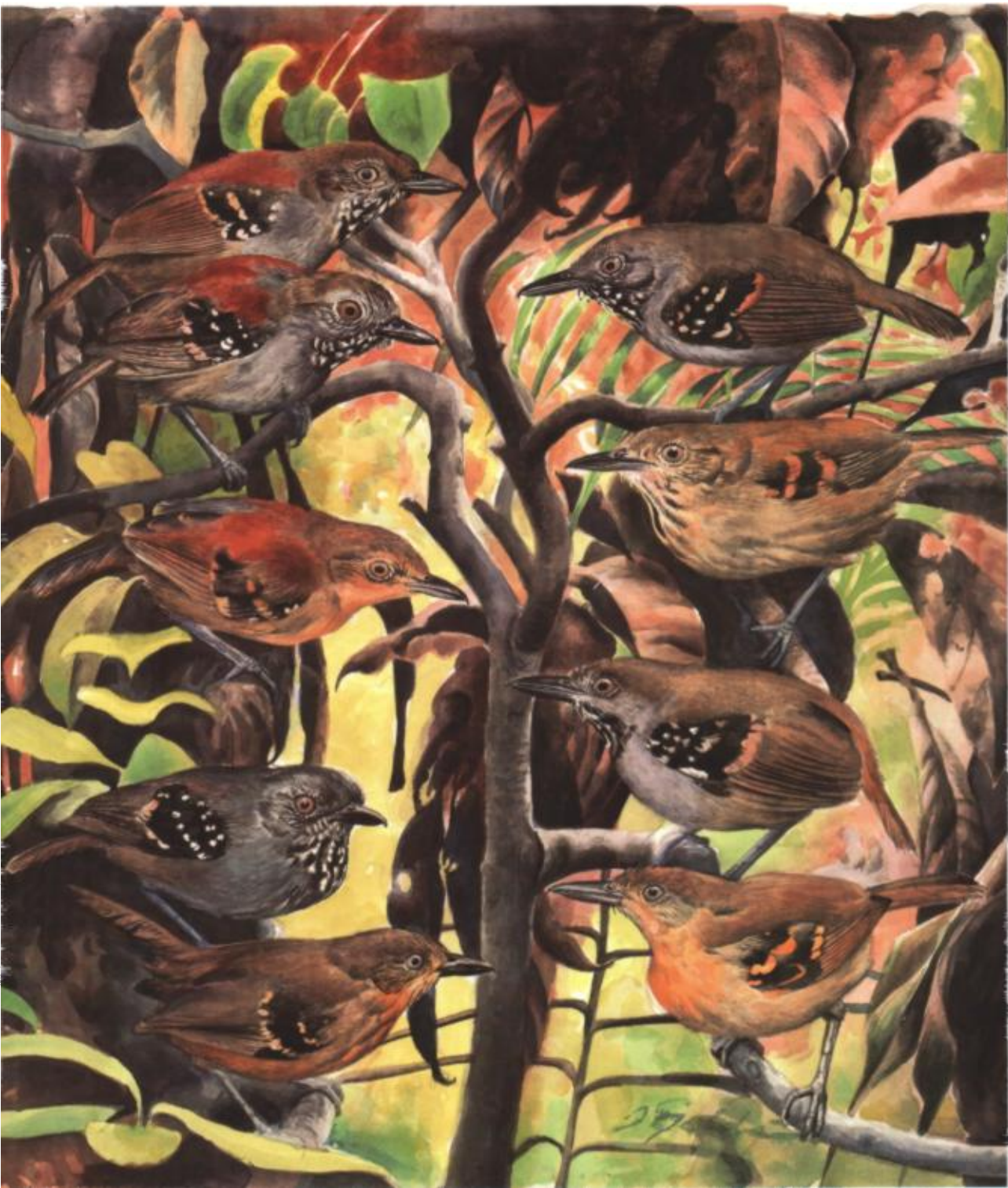
FRONTISPIECE. Left from top to bottom: Myrmotherula haematonota haematonota male, Myrmotherula haematonota pyrhoneota male, Myrmotherula haematonota pyrhoneota female, Myrmotherula spodiopota spodiopota male, Myrmotherula spodiopota spodiopota female. Right from top to bottom: Myrmotherula fjeldsaai male type, Myrmotherula fjeldsaai female, Myrmotherula leucophthalma leucophthalma male, Myrmotherula leucophthalma leucophthalma female. Water color painting by J. Fjelds .