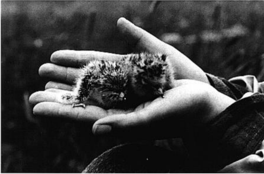
FIG. 2. Hybrid Roseate \times Arctic chick (on right) and Roseate Chick (on left) at two days of age.

chick lacked the characteristic spiny texture of Roseate chicks (Cramp 1985; Fig. 2), and it never developed the dark, U-shaped markings on the mantle, back and tertials which are characteristic of juvenile Roseate, but not Arctic, Terns (Malling Olsen and Larsson 1995). The color and markings of the chick's down resembled those of both Arctic and Roseate chicks, and at 15 days the chick's purplish brown legs and flesh-colored bill were intermediate in appearance between those of Arctic and Roseate fledglings (Table 2).