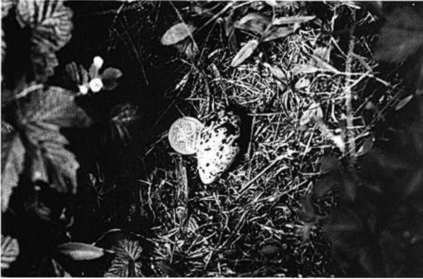
FIG. 1. Egg of interbreeding Roseate and Arctic Tern.

Wildlife Service #811-26033). The Roseate began incubating four minutes after the Arctic Tern was removed from the trap. The egg hatched on 2 July, after a 21 day incubation period (Table 2), which was two days shorter than the mean incubation period for 27 Ro-