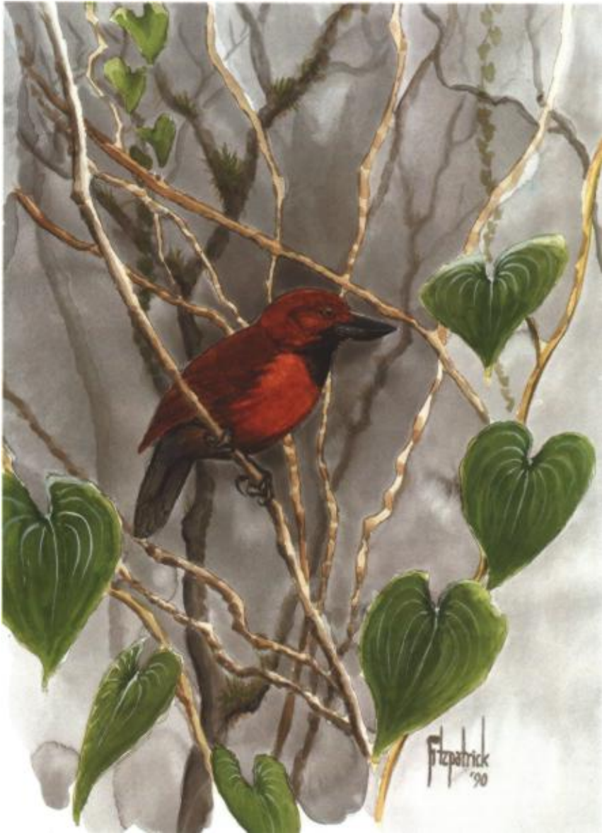
Rondonia Bushbird ( Clytoctantes atrogularis sp. nov.), a new species of antbird from western Brazil.