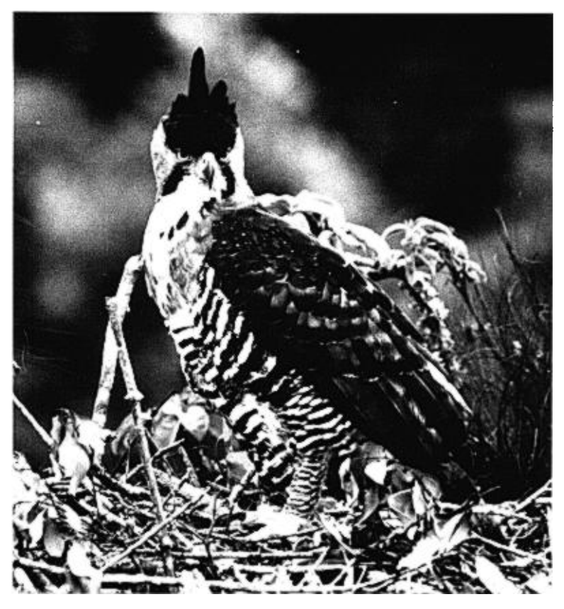
FIG. 2. Female at nest B during one of her breaks from incubation.

Nest B (Fig. 1) was 26 m up in a huge 30 m emergent silk cotton tree, well out from the main trunk near the end of a large side branch. The nest was 5 m above the top of the canopy, and its location afforded a clear view of the surrounding forest. The nest was roughly oblong in shape and was made of sticks between 5 and 10 mm in diameter. It measured 125 by 85 cm across and was 50 cm deep. When we climbed to the nest on 6 April it contained a single white egg, spotted with small faint brown-ish-red blotches. This is in contrast to the unspotted bluish-white eggs laid by a captive female (Kiff and Cunningham 1980), the only other egg description for this species.