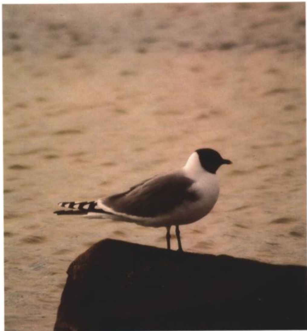
Adult Sabine's Gull ( Xema sabini ). on East Bay, Southampton Island, N.W.T., Canada.