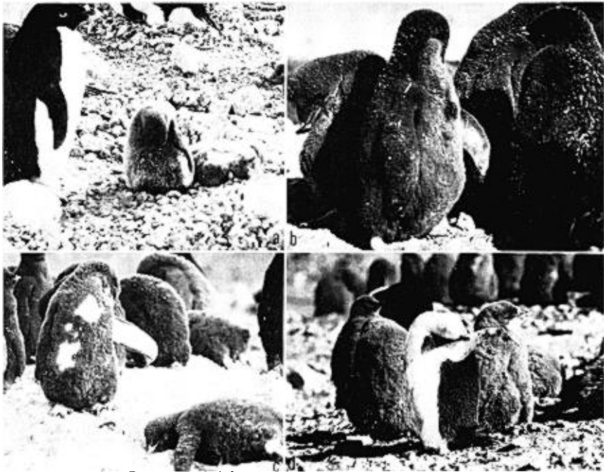
FIG. 2. (a) Four- to 5-week-old chick back preening. Note the loose down. (b) Five-week-old chick preening its shoulder. (c) Six-week-old chick preening its shoulder. Note the patches of contour feathers on the breast, belly and wing. (d) Seven-week-old chick performing bill-to-wing-edge, during which the bird grasps the top edge of the wing between its mandibles and draws the bill along the wing's edge toward its body. This is the first step in the transfer of oil to the head.

possible to observe the same chicks or adults throughout the duration of the study so for analysis we assumed that the samples were independent.