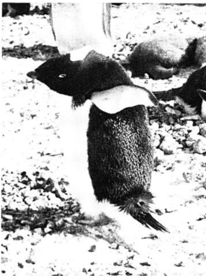
FIG. 3. Wing-rubbing by an adult. This is the action used to transfer oil from the wing edge (Fig. 2d) to the head. Note the feather tuft surrounding the uropygial gland at the base of the tail.

the gland (Fig. 3) did not reach full length until days 34–38. When oiling, the penguins contact this tuft with the bill.