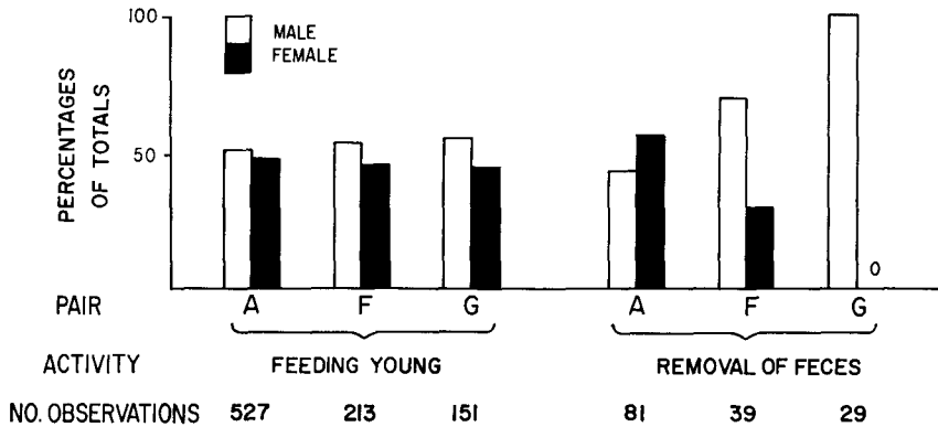
FIG. 1. Observations on 3 pairs of nesting sapsuckers showing that while the task of feeding the young was shared by both sexes to a nearly equal extent in all pairs, that of nest sanitation varied considerably. Observation times, here combined, were between 08:00–10:00 and 15:00–17:00.

young, while Nest A in 1974 contained 4. As shown in Table 4 the feeding rates declined in stepwise fashion from Nest A with 4 young to Nest H with only 2. But the decline was not proportionate to the number of young, for the fewer the nestlings, the more each one received from its parents. These extra feedings may have hastened the time of nest leaving; the single nestling in Nest H, for example, having left on day 26 as contrasted with the 4 nestlings of Nest A that left on day 28.