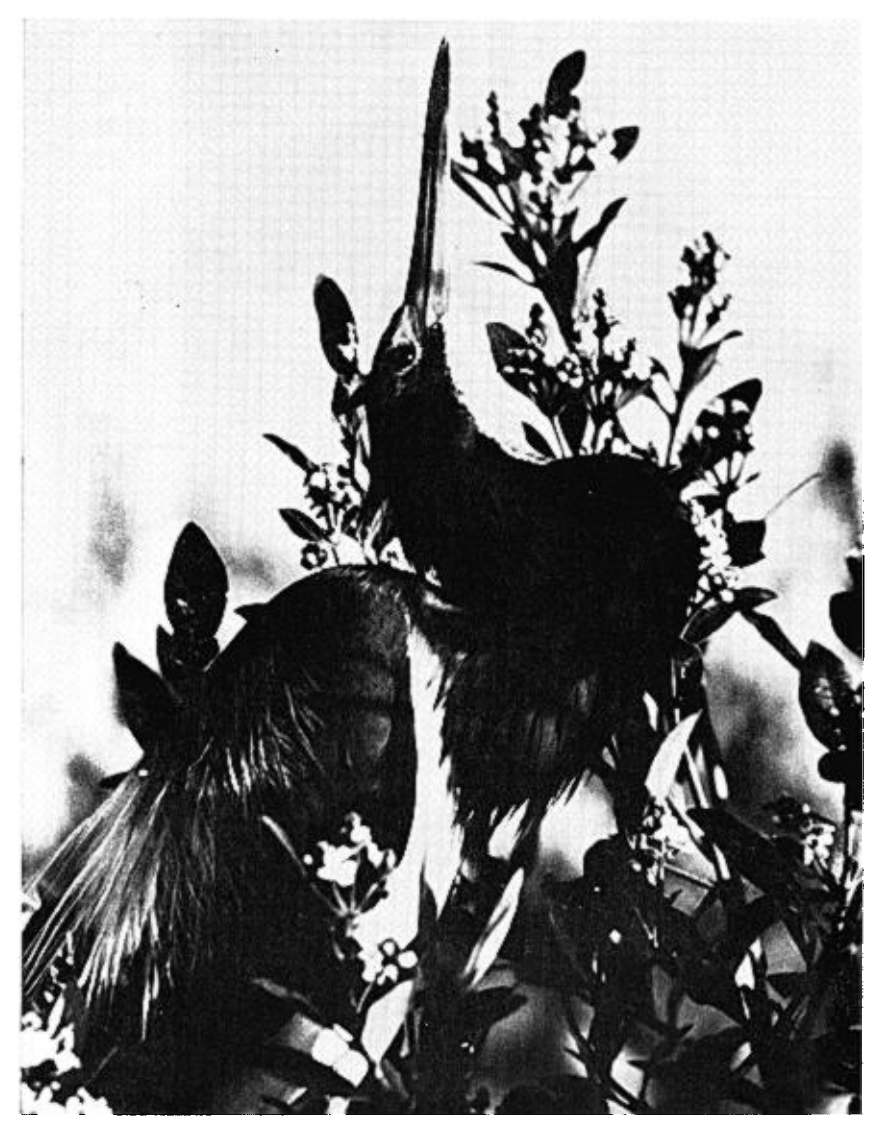
Fig. 2. The Stretch display performed by a male Louisiana Heron from its nest.

(5) As the head lowers onto the back the legs bend, causing the body to descend toward the nest, and the wings are further opened and partially extended out to the sides (Fig. 1F). During this downward pumping motion, the mandibles are brought together to produce a mechanical "snap" sound.