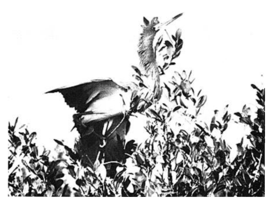
Fig. 4. Male engaged in the "Greeting display" phase of the Circle Flight after landing on the nest bush. Compare this posture with that in Fig. 5.

the females made fewer calls than the male. Meyerriecks (1960) reported mutual performance of the Circle Flight by male and female Green Herons, Reddish Egrets, and Snowy Egrets.