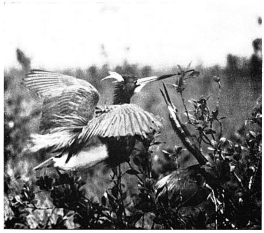
Fig. 5. Greeting display performed by a new pair of Louisiana Herons. The male (left) holds the twig skyward in his bill as he passes it to the female. Note the amount of feather erection by both herons.

A male performing the Greeting display returns to the nest with a twig in his mandibles and extends the head fully upward and exhibits extreme feather erection of the crest, upper neck, to a lesser extent the lower neck, and the aigrettes. Simultaneously, the wings are held out to the sides, and the bill, with the twig in the tip, is pointed repeatedly toward the zenith, then downward toward the nest, while the male gives several "culh-culh" calls (Fig. 5). The female on the nest engages in the same behavior as she reaches out and takes the twig in her mandibles from the male. Both herons head-nod several more times, giving additional calls, and the pair usually engages in Bill-nibbling. Feather erection ceases soon after the female places the twig into the nest as the male looks on intently. The male then leaves, and the procedure is repeated again until the nest is completed. If the nest is erected deep inside a dense mangrove bush, the male extends his head down into the bush and the female reaches up from within the foliage to take the twig.