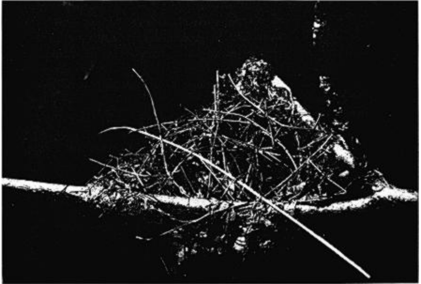
FIG. 2. Long-tailed Manakin nest under construction at Finca Jiménez, Guanacaste Province, Costa Rica. Note the leaf midrib lying across the upper perimeter of the nest; it is partially interwoven with other fibers but not shaped into the cup of the nest.

general shape of the nest is apparent. Approximately half a day is required for construction to reach this point. Next the leaves hanging from the rim or bottom of the nest are added, if they are to be included. At approximately the same time the leaf-moss layer is laid down from the inside. The innermost layer of hyphae and midribs is the last to be added. This is done in several ways. The most common is by placement of several strands of material across the nest so that they protrude on either side (Fig. 2). The female then lands on the center of the nest cup bending the strands with the weight of her body. She wiggles her body laterally as if settling in on the nest at the same time rotating her body slightly. Initially then, the nest is a half sphere which is periodically pushed down in the center. Often when settled in the nest the female leans over to the outside reaching with her bill to poke and rearrange material. She also perches on the rim of the nest or on the supporting twig between connection points leaning to the inside to rearrange material or to reinforce connections. Some fibers are poked into the outside of the nest, brought up over the supporting twig and attached on the inside.