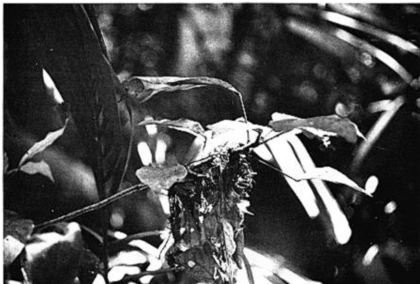
FIG. 1. Long-tailed Manakin nest from Finca Jiménez, Guanacaste Province, Costa Rica. Note roofing provided by adjacent leaves and camouflaging leaves hanging vertically from the rim and underside of the nest.