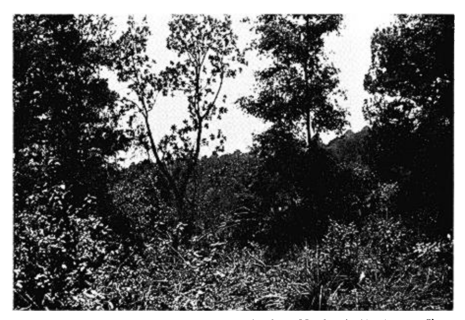
FIG. 1. Disturbed pine-oak forest S of Tres Cumbres, Morelos (2880 m), in a Chestnut-sided Shrike-vireo territory.

resulting in a mosaic of small fields and patches of forest (Fig. 1). We worked in both localities for parts of 3 days in November 1971 and 6 days in November 1972 and 16 days each in May 1972 and 1973.