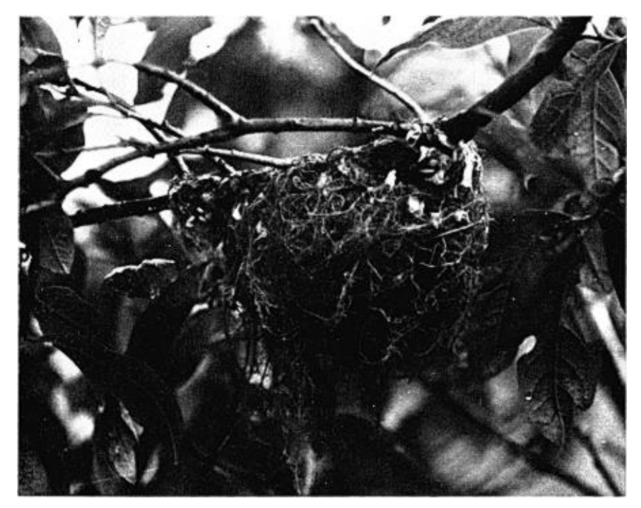
FIG. 3. Nest 1-first known nest of Vireolanius melitophrys in a sweetleaf (Symplocos sp.).

Externally Nest 1 (Fig. 3) measured 100 mm in maximum diameter, 80 mm in minimum diameter, and was 66 mm deep from rim to bottom. Internally the nest measured 70 mm in maximum diameter, 60 mm in minimum diameter, and 50 mm deep. The branches of the fork from which the nest was suspended were 6 and 8 mm in diameter and the fork subtended an angle of 45°. The nest was lined with fine grasses, pine needles, and fibrous plant parts. The bag was largely constructed of filamentous lichen, woven together with spider webbing, and adorned on the exterior with spider egg cases. Except for being larger, the nest closely resembled nests of the 14 species of vireos with which we are familiar. Nest 1 was completed between 8 and 18 May. Judging from our experience with building rates in vireos and extrapolating accordingly, about 20 days were required for total construction. Progress at Nest 2 was slower and as much as 25 days may have been required for its completion. Certainly so large a nest as that built by the Chestnut-sided Shrike-vireo could not be finished very rapidly at the rate of no more than 5 or 6 building