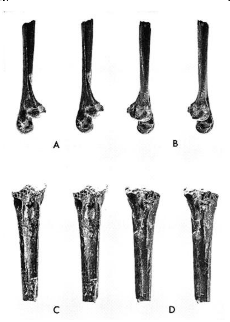
Fig. 2. Stereophotographs of tarsometatarsi of Rhegminornis calobates , about twice natural size. a. Holotype (MCZ 2331), internal view. b. Same, external view. c. Referred proximal end (PB 1776), anterior view. d. Same, posterior view.