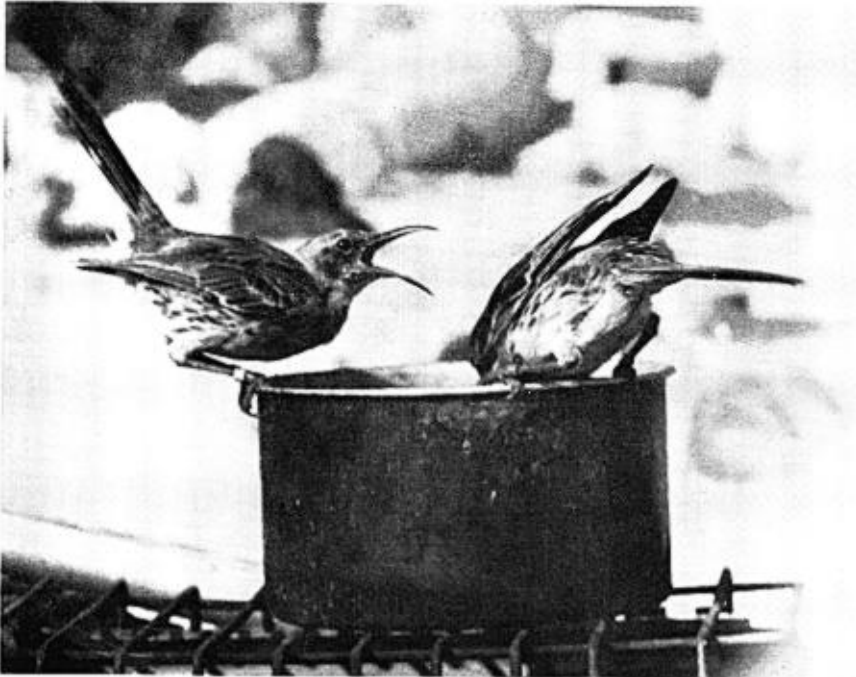
FIG. 1. Begging Display. The bird on the right has just arrived and is dominant to the bird on the left.

mostly seen between 1, 3 and 5, 6, suggesting that they were pairs, but I saw no copulation. Dominant birds also chase squawking subordinates. I could detect no differences in the dominance of individuals in different parts of the group territory, but I did not set up feeding stations or watch extensively at distant sites. Some of the interactions within RW's band during 0600–1200 hours on 15 December 1962 are recorded in Table 1.