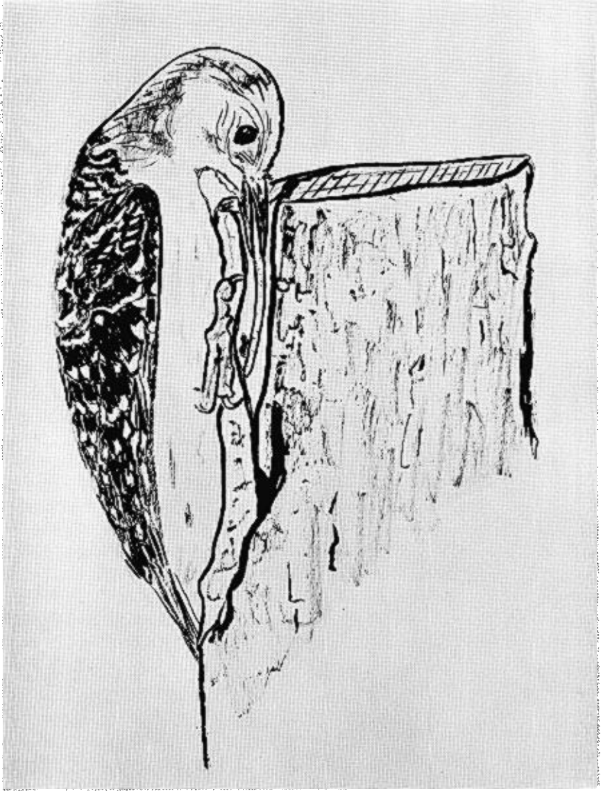
FIG. 1. Captive Red-bellied Woodpecker using tongue to recover piece of bread from vertical cleft.

wood several inches long, arrange it to point straight forward in his bill, then fly over the aviary in search of a storage place. This same male was preparing to store another and smaller chip on 6 April 1960, when his mate