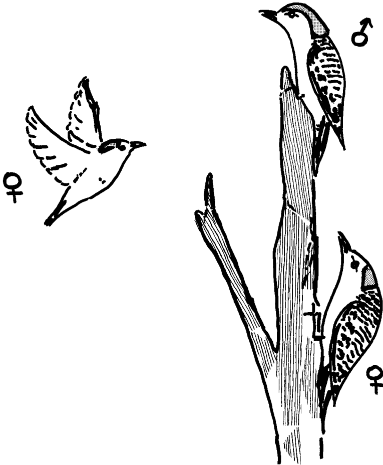
FIG. 1. Episode in a conflict observed on 30 January 1960, in which two rival females fought for a male. The intruding female is in the stiff pose expressive of tension as owning female approaches the tree from the left in a floating threat display.

Displays. —(a) The feathers of head and nape are raised when a Red-bellied Woodpecker is excited. This is particularly true of the male whose red feathers, being somewhat long and silky, give him a striking appearance.