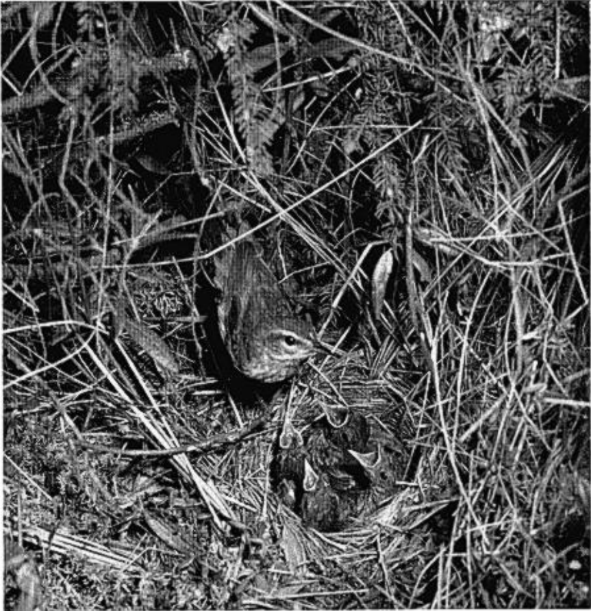
FIG. 2. Palm Warbler feeding nestlings 2 miles east of Seney, Michigan, June 23, 1956.

in leatherleaf ( Chamaedaphne ) and dead grass combination; the fourth was sitting on a jack pine branch one foot from the dry ground on the island of thick jack pine (Fig. 3). All the fledglings were captured and banded. The female fed the young regularly, but the male refused to do so while they were being photographed.