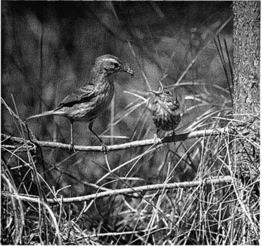
FIG. 3. Female Palm Warbler with recently-banded fledgling, one-half mile north of Seney, Michigan, June 25, 1956.

Palm Warblers were not found in 'colonies' in any Michigan areas, but rather in scattered pairs. In some areas, probably more favorable, more pairs were located than in others where solitary singing males were observed. Thus, the discovery of one pair is no guarantee that others will be found in the vicinity.