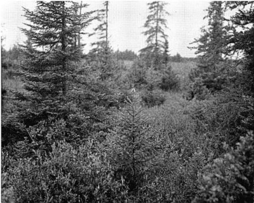
FIG. 4. Nestsite of Palm Warbler at base of black spruce ( Picea mariana ), 2 miles east of Seney, Michigan, June 23, 1956.

At Fawcett, Alberta, between the Pembina and Athabasca rivers, Walkinshaw found a nest with five eggs on May 25, 1942 (no. 15). This area was quite open, predominantly muskeg, surrounded by forests of black spruce and tamarack, with ridges covered with jack pine. In an area of drier muskeg, not far from a ridge, he flushed the female from her nest. It was an open location with a few small dwarf birch ( Betula ) growing in close proximity. The nest was beneath one of these little birches in dead grass on a sphagnum hummock. It was made of fine grass, lined with finer grasses, feathers, and fine rootlets. It measured 80 mm. across outside, 50 mm. across inside and 42 mm. deep.