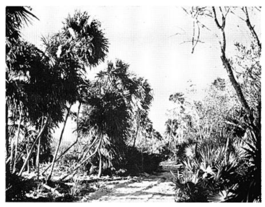
FIG. 3. View near the edge of the forest where it borders the savanna. To the left of the road, beyond the screen of palms, all trees have been removed, the larger ones for timber, and the small ones and undergrowth for charcoal.

[Crotophaga ani. Smooth-billed Ani; Judío].—This Ani is a common bird in Cuba, where it inhabits savannas or open cultivated country with a few trees, and therefore was not present at the Cape. Its life history in Cuba has been studied by Davis (1940) at the Atkins Garden and Research Laboratory at Soledad near Cienfuegos in Las Villas. The feeding habits of the closely related Groove-billed Ani (Crotophaga sulcirostris) of Central America were studied by Rand (1953). Both species feed chiefly on moving animals, mostly insects, but, according to Davis, the Cuban one changes its food habits with the season. During the dry season it subsists largely on vegetable matter, whereas in sulcirostris no such change is noticeable, according to Rand, and vegetable matter seems to be eaten sparingly. Both species follow cattle and, according to Davis, the Cuban bird learns readily to follow closely the footsteps of a man, or even a gasolinepowered mowing machine, to glean the insects disturbed. In view of the fact that the anis and Mrs. Vaurie and I are fellow insect collectors, I tried to see how successful they were but, strangely enough, I never saw them catch an insect.