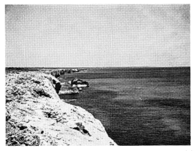
FIG. 1. Cliffs along the southern coast of the Peninsula de Guanahacabibes.

disappearing, and a large saw mill has been erected. Worst of all, it is beginning to be invaded by charcoal burners who use the smaller remaining hardwood species. Figures 3 and 4 show the depredations already suffered. This type of forest grows very slowly and, once it is destroyed, it is not likely to be replaced. When it is gone the Peninsula will be transformed into a wilderness of scrub and rock, as it has little soil and cannot be used for agriculture or grazing. The Peninsula, or at least its southern half, could