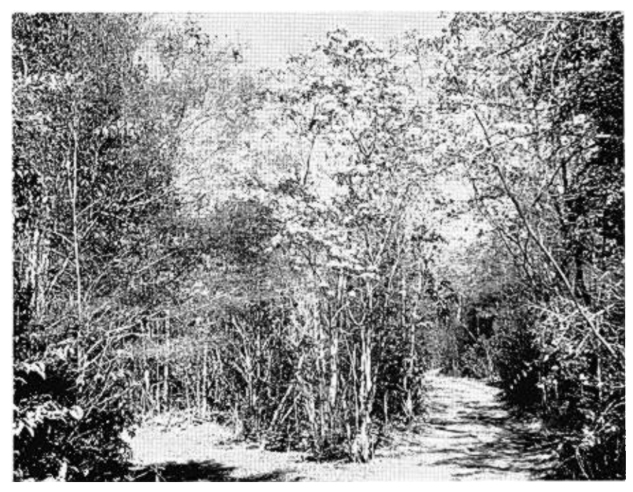
FIG. 4. View of the interior of the forest. The road was built by loggers who removed all the large trees, but this part of the forest has not been invaded as yet by charcoal burners and the undergrowth is undisturbed.

fore, when a male appeared at a smaller bush somewhat separated from those fought over by the Emeralds. It fed quietly for some seconds and was joined by a female of its species, and then by a male Emerald. The two species showed no signs of being aware of each other, moving about on the same bush about a foot or two apart. The contrast in the mutual behavior between the two species and the squabbling among the Emeralds a few feet away was very great. As Zayas wanted to take some pictures, the male helenae was captured easily in a sweep of the butterfly net and released a few minutes later unharmed. While held, it remained silent and at no time offered the slightest struggle. Its anxiety, if any, was expressed by one or two movements of the head and a few blinks. Zayas tells me that on several trips to the Cape he has seen but one male on each trip, always in the same vicinity. The Cubans that we talked to show much interest in this bird not only because they know that it is very beautiful but also because they have been told that the male is the smallest of all birds. Yet almost no one that we talked to had seen it. In the one that I held, the body, not counting the tail and bill, was barely over an inch long and the toes about the thickness of an insect pin of very small gauge.