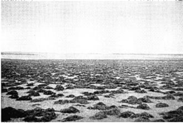
FIG. 1. Muddy tundra of the Purple Sandpiper breeding ground. Photographed August 15, 1953, near the southeast corner of Lake Amadjuak, Baffin Island.

Measurements, in millimeters, of our three adult males (GMS Nos. 11718, 11820, 11848) are: wing, 178, 173, 179; tail, 67, 65, 69; exposed culmen, 23.5, 23.5, 23.0; tarsus, 40.0, 42.0, 42.0. The specimens represent the nominate race.