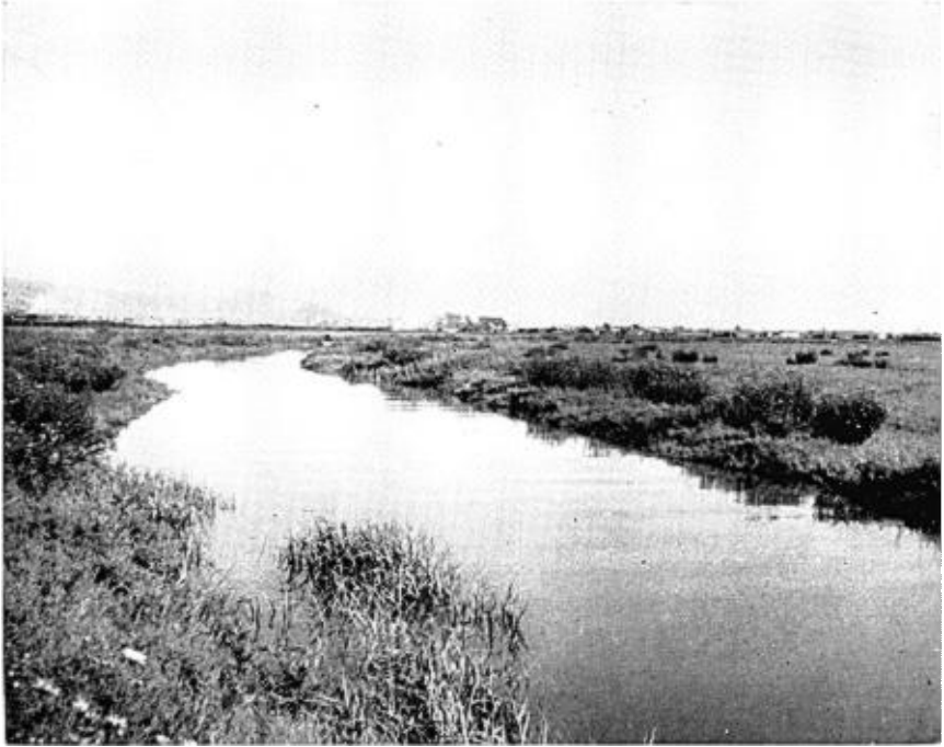
FIG. 1. A tidal slough on San Pablo salt marsh. The slough is about 25 feet wide. In the center foreground Spartina is evident; along the slough banks grows Grindelia ; the remainder of the vegetation is almost wholly Salicornia .

Numbers of the owls. —A trustworthy method of counting these birds was not developed. The behavior of the owls in the presence of an observer was highly unpredictable. They would not necessarily flush when an observer was as close as 20 yards from them. Those that did flew variously 50 to 500 yards. It was not always possible to determine the exact spot on the marsh where the birds alighted because the marsh is flat and diagnostic landmarks uncommon. Thus, when an owl was flushed, frequently it was difficult to know whether or not it had already been counted.