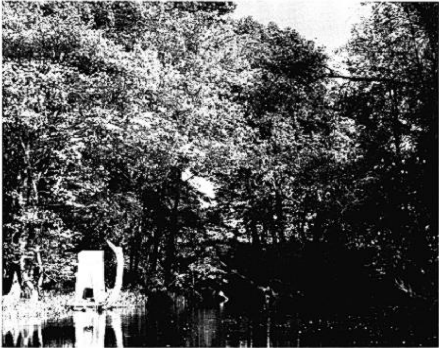
FIG. 1. Nesting habitat of Prothonotary Warbler in Calhoun County, Michigan. One pair nested in the dead stub near the blind. Photographed by Lawrence H. Walkinshaw on June 13, 1948.

I usually found the first male of the year in the early morning. Often there had been no bird in the same place the day before. At first, territories were rather large, taking in great stretches of river. As other males arrived, battles ensued, the new males each finally taking possession of some restricted water frontage and the earliest male trying to retain as much as