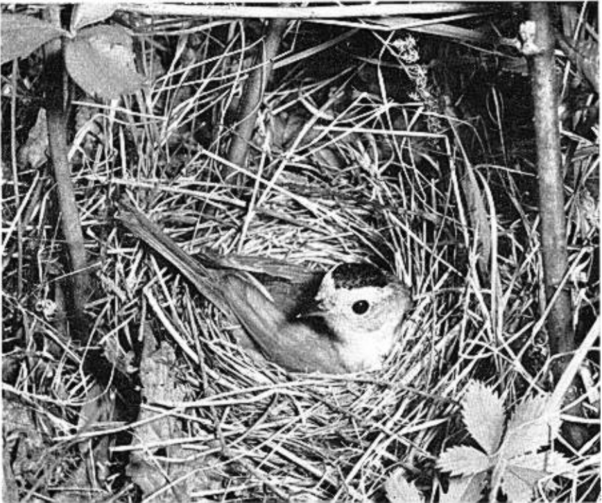
Female Wilson's Warbler on nest. Photographed in Hancock County, Maine, on July 13, 1950, by Hal H. Harrison.

least ten days and about four hours (4 p.m. July 1 to shortly after 7:30 p.m. July 11) and at most 12 days (about 8 p.m. June 30 to shortly before 8 p.m. July 12). The female probably spent the night of June 30 on the nest, laid her fourth egg the following morning, and continued her incubation until the hatching. Early on the morning of July 13 we found four young birds in the nest, but one was dead under the other three. We removed the dead bird.