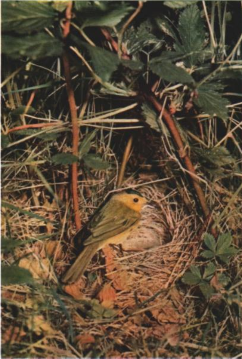
WILSON'S OR BLACK-CAPPED WARBLER ( Wilsonia pusilla pusilla )