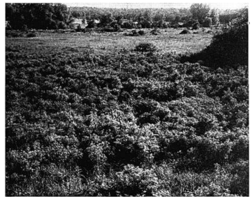
Fig. 2. View of the study area looking south. The highest breeding density occurred in these loose clumps of elderberry.

Authors disagree about territorialism of Goldfinches. Walkinshaw (1938) and Nice (1939) found no evidence of conflict between pairs and believed Goldfinches showed a definite sociability in nesting. Drum (1939), on the other hand, found definite territories that were actively defended against all males trying to settle within the territory.