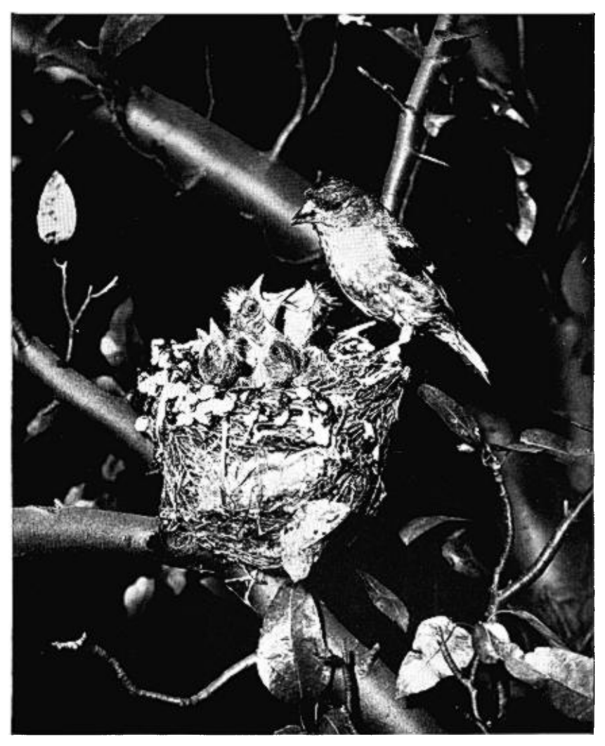
FEMALE GOLDFINCH AT NEST. THE MANY DROPPINGS ON THE RIM ARE CHARACTERISTIC OF GOLDFINCH NESTS TOWARD THE END OF THE FLEDGING PERIOD.