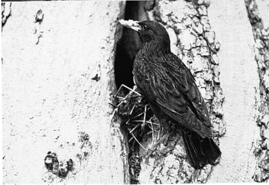
STARLING IN RECENTLY ACQUIRED FALL PLUMAGE (upper) AND IN THE WORN SPRING PLUMAGE (lower)