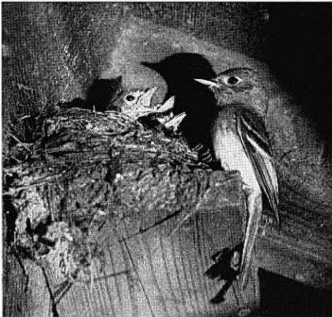
Figure 3. Western Flycatchers at nest (F-1) built on the end of a board beneath the eave of Garage A. May 29, 1940.

On July 4 it was observed that nest F-1, which had remained more or less intact on the board beneath the protecting eave since its second use in the preceding season, was again being renovated by a flycatcher.