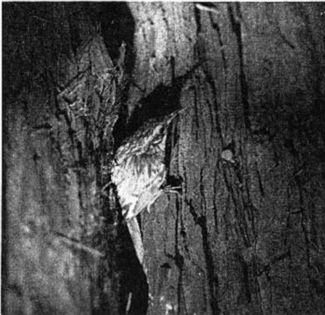
Figure 4. Adult Creeper leaving nest crevice (nest C) on the side of House I. May 18, 1940.

Season of 1941. —On March 11 a pair of wrens was observed building a nest (W-1) inside Garage B, 80 feet south of Garage A (Figure 2). The nest was placed on the roof plate about eight feet above the ground. The young left this nest on May 3.