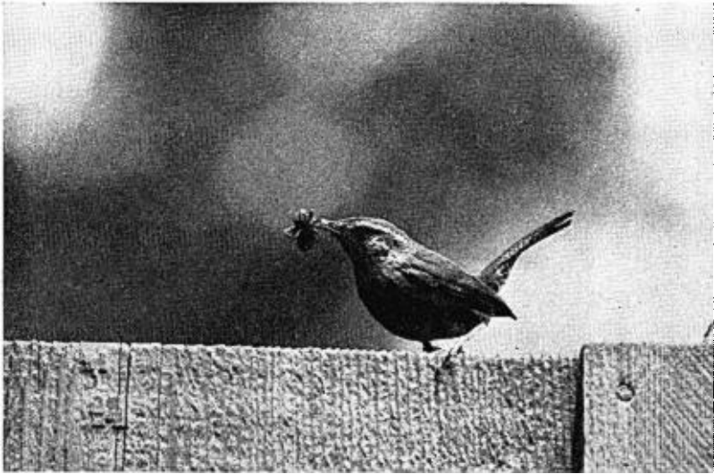
Figure 5. Bewick's Wren on the door of Garage A, carrying a spider to feed its young in the nest within the garage. June 15, 1941.

Season of 1941. —On June 10 a female junco was seen carrying nesting material into Garage A, where the wrens had nest W-2 which then held six eggs. Large masses of dry grass were brought in on June 11. On June 16 a nest (J-2), containing two eggs to which a third was later added, was found 10½ feet away from Nest W-2 on the roof plate on