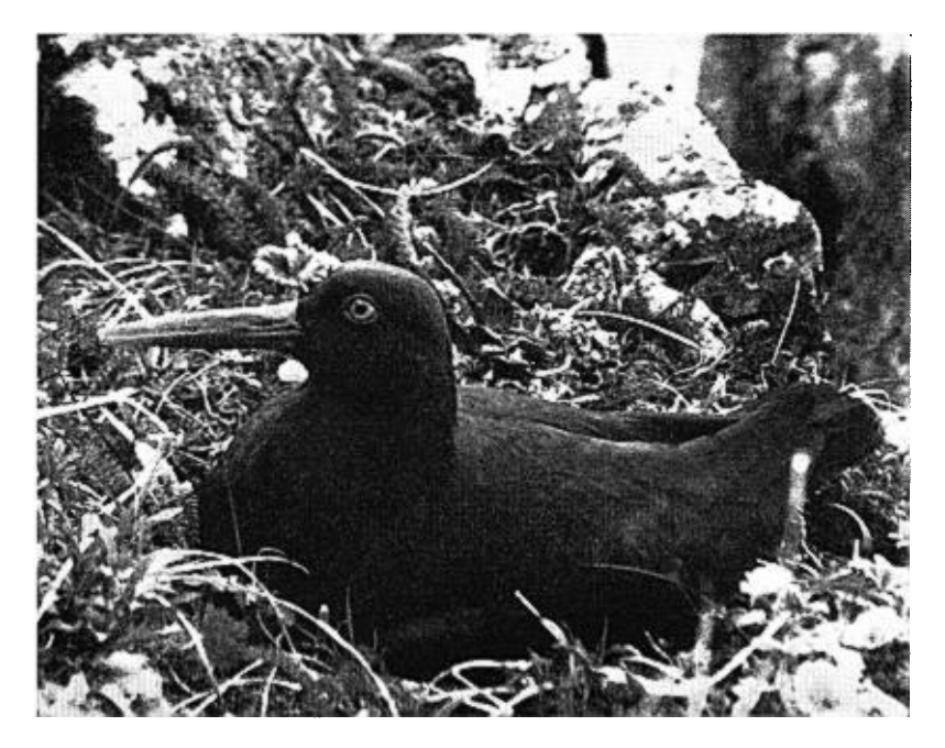
Figure 5. Black Oyster-catcher incubating.

Behavior of young European Oyster-catchers was analyzed in detail by Dewar (1920) and his work should be read for a full understanding of the progress of the young birds.