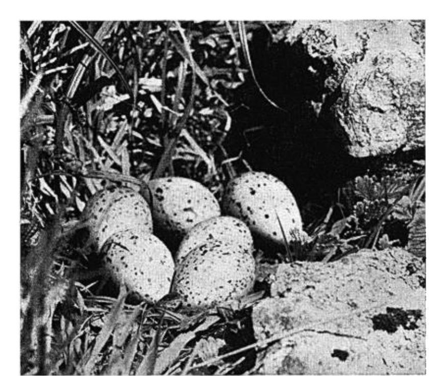
Figure 4. Nest 10, Kayak Island, with six eggs laid by two hens.

tide had turned and flew directly to a point near its mate on S W Point. Both bowed and piped; then, after two minutes of inactivity, the other bird began moving toward the nest. These cases, together with stomach analyses of specimens taken and the fact that many hours of observation at high and middle tides failed to record a change of incubating bird, have led to the formulation of the following theory: A pair of Black Oyster-catchers change places on the nest very near the time of