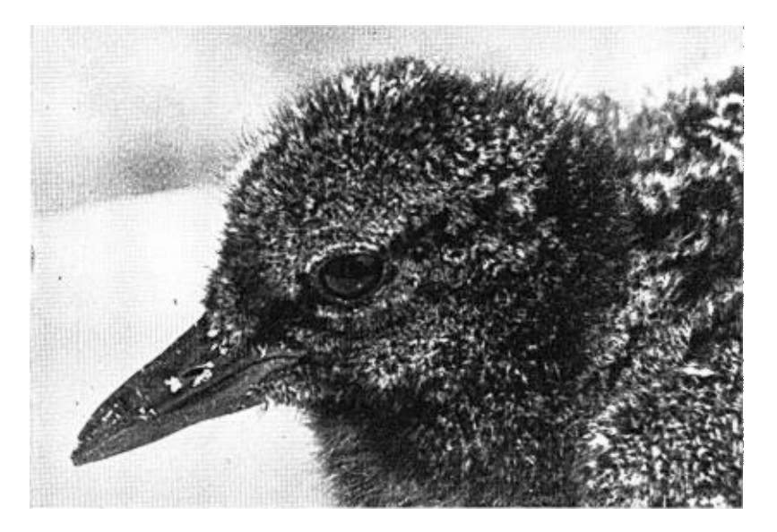
Figure 6. Black Oyster-catcher one week old. Note the egg tooth.

Preening begins about the fifth day of the chick's life, and about the same time the bill, when soiled, is wiped on the plumage. In the fifth week the chick commences to rest on one foot and sleep with the bill under the scapulars.