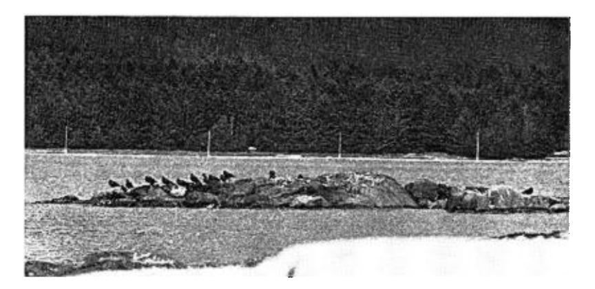
Figure 3. Flock of Black Oyster-catchers on Cormorant Rock at high tide. Note the two juveniles at the far right.

Piping was never observed in the flock during July or August, but it was noted during March and April. The flock's general schedule consisted of a period of resting and sleeping during high tide, crowded together on Cormorant Rock, then feeding, scattered out over a halfmile or so, on the rocks or flats on the latter part of the ebb and the