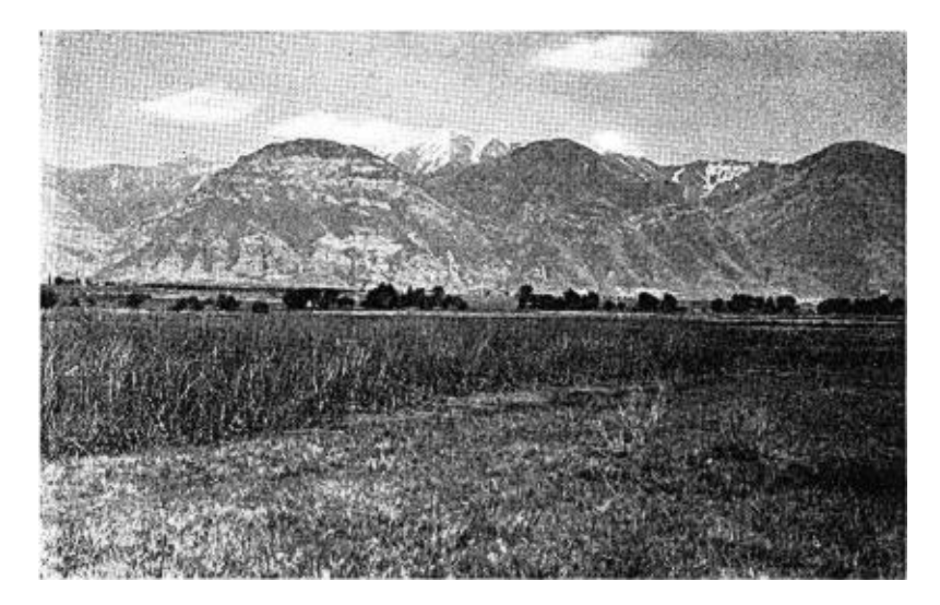
Figure 1. Nesting area of the Lakeview colony.

In some clutches each of the eggs hatched consecutively on the thirteenth day after they were laid, indicating that incubation had begun at the time the first egg was deposited and that the length of the incubation period in such instances was 12 days. The eggs of other clutches hatched consecutively in the order in which they were laid on the fourteenth day after being deposited, indicating that incubation