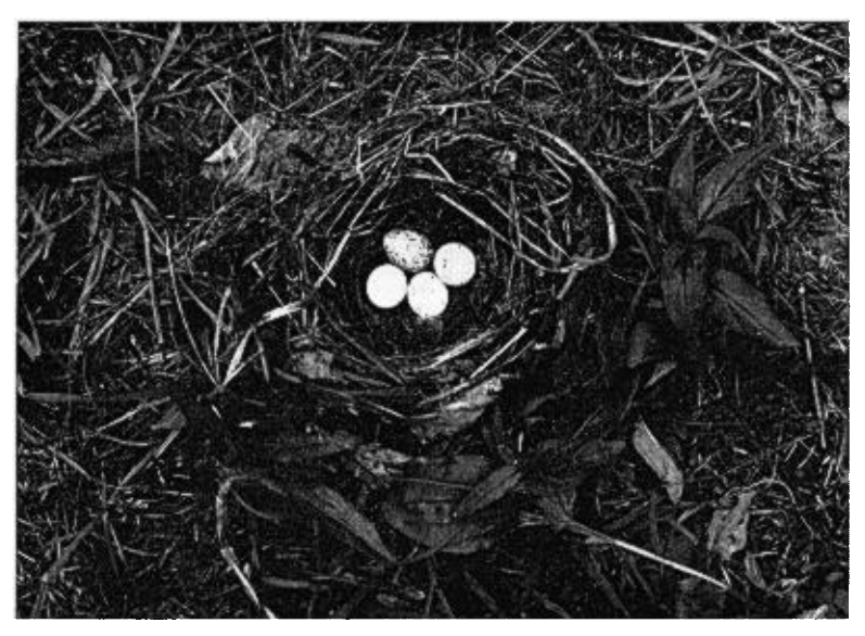
Fig. 19. Nest of Bachman's Sparrow parasitized by a Cowbird. The nest is completely open. French Creek, Upshur County, West Virginia.