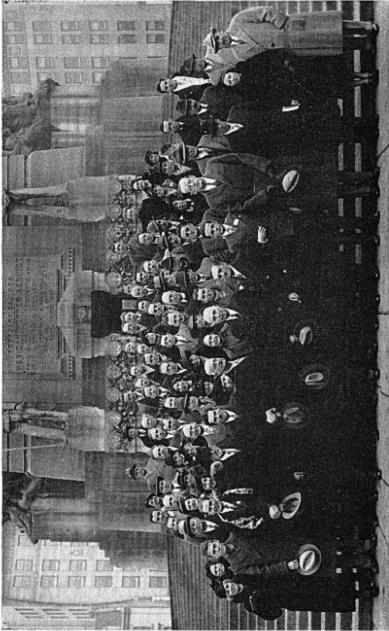
FIG. 16. Group at the Annual W. O. C. Meeting, Indianapolis, 1937.