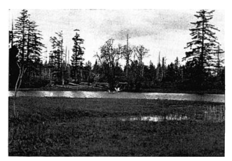
Fig. 11. A resting place for Northern Bald Eagles, Tl-ell, B. C., with a Trumpeter Swan in flight.