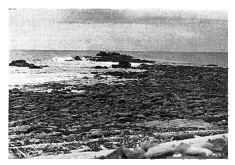
Fig. 9. A Boulder Reef, at low tide, on Graham Island, B. C. A feeding ground for the Northern Bald Eagle.