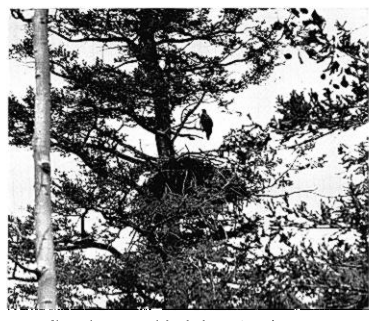
Fig. 12. Nest and one young of the Northern Bald Eagle, Horse Lake, B. C.