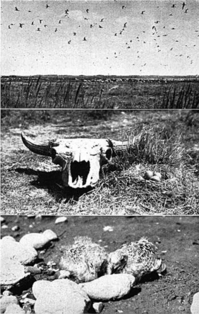
FIG. 33. Nesting colony of Ring-billed Gulls, at Bittern Lake, Alberta (above). Nest of a Ring-billed Gull at the side of a bison skull (middle). Young Ring-billed Gulls (below).