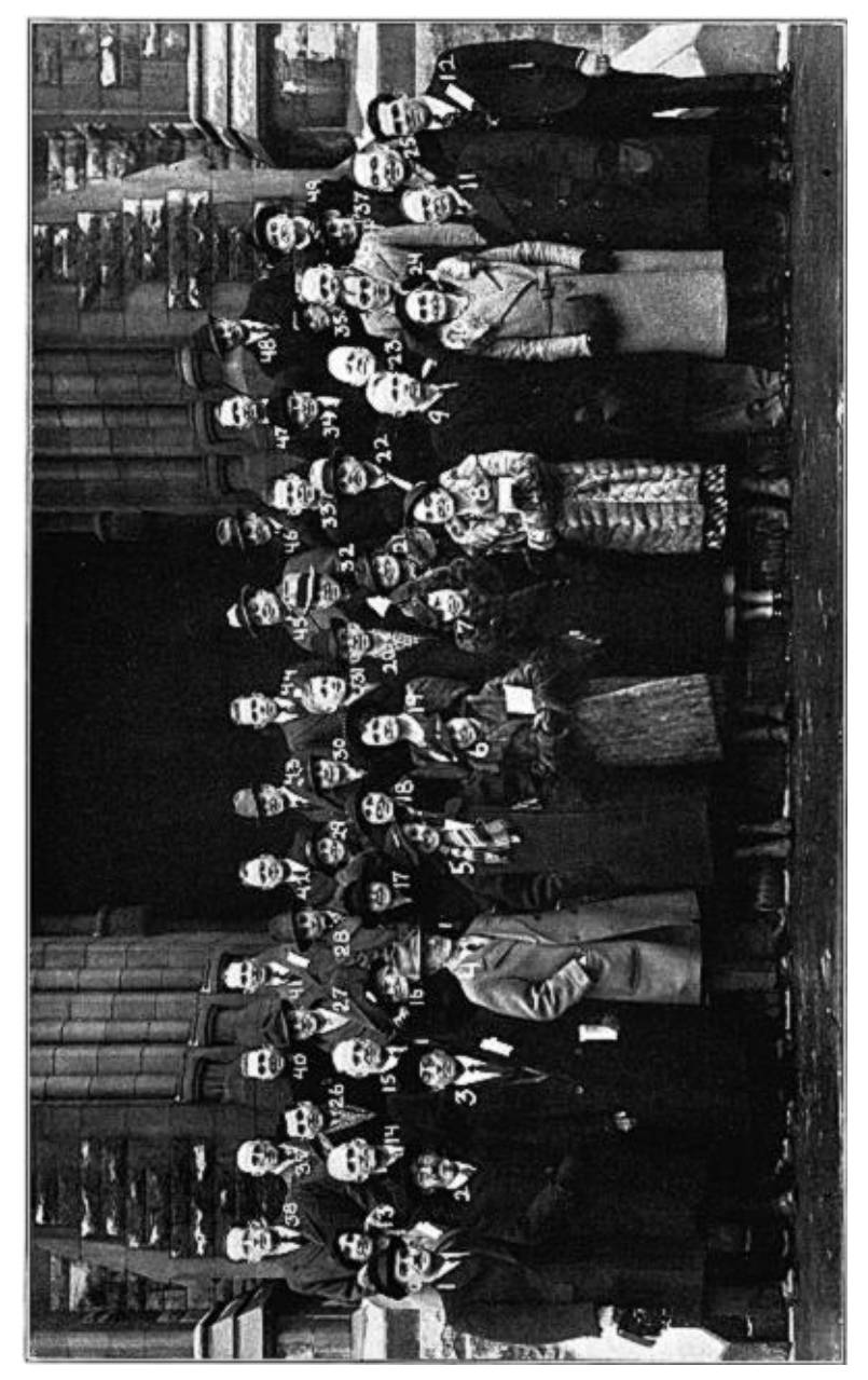
Fig. 13. Group at the Annual W. O. C. Meeting, St. Louis, 1935.