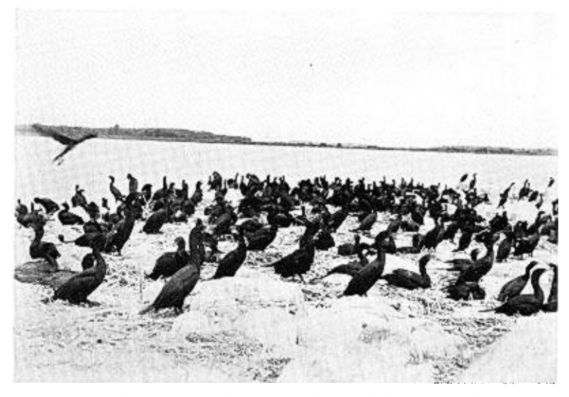
Fig. 57. Closer view of the birds.