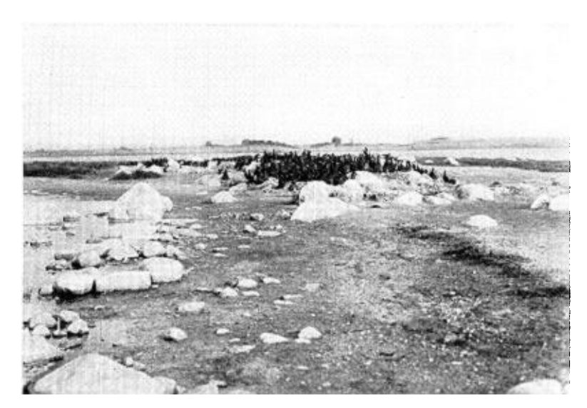
Fig. 56. The Double-crested Cormorant colony on the island in Waubay Lake, S. D.