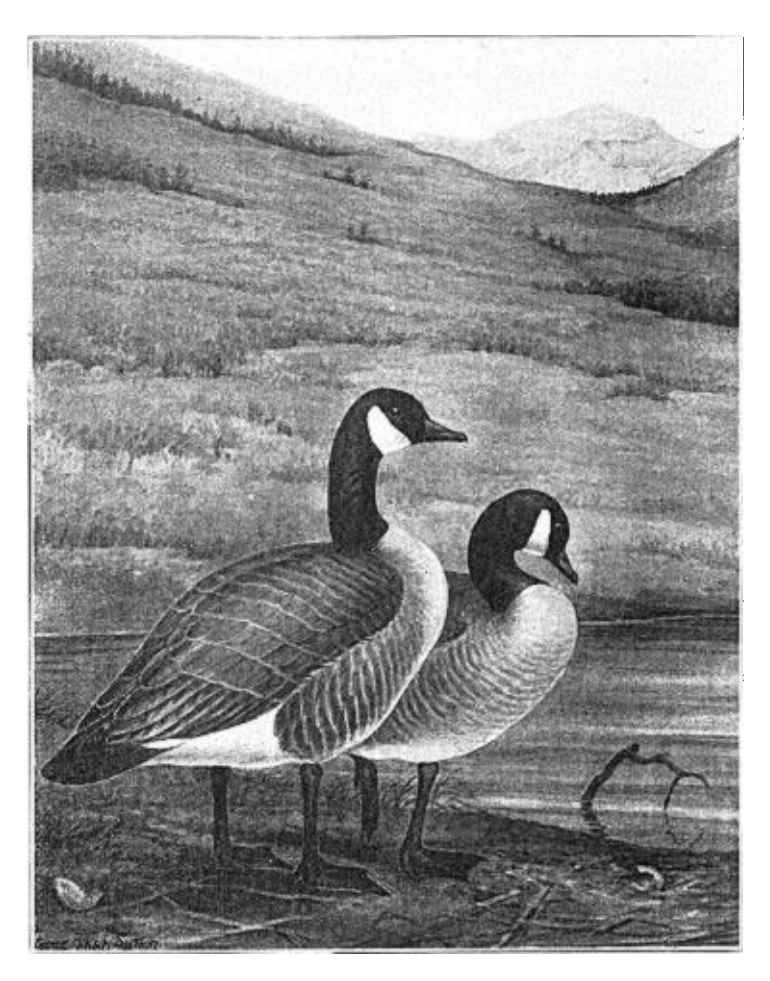
Canada Geese in Yellowstone Park By George Miksch Sutton