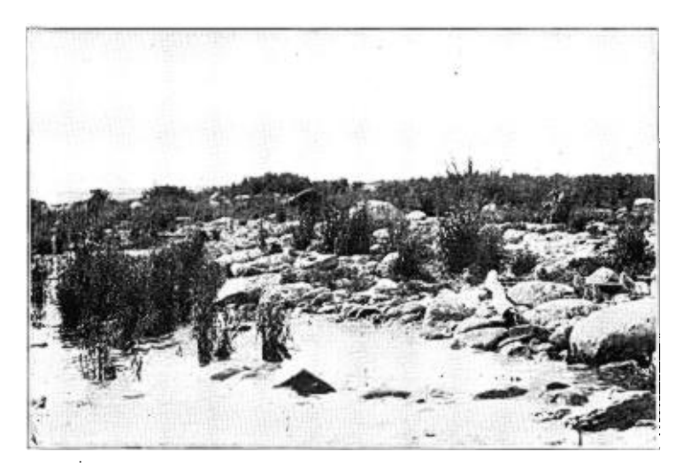
Nesting Site of the Ring-billed Gulls on St. Martins Shoal.