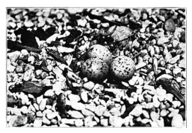
Nest and Eggs of the Caspian Tern on Gravelly Island. Note the Crayfish Claws around the Nest.