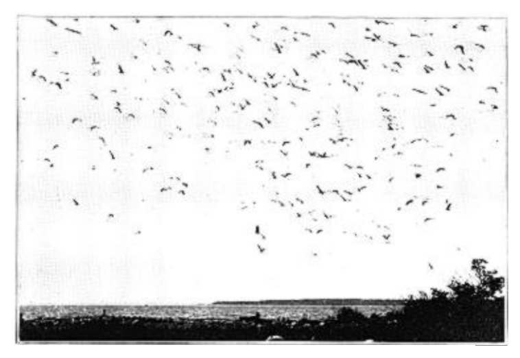
Ring-billed Gulls in the air at St. Martins Shoal.