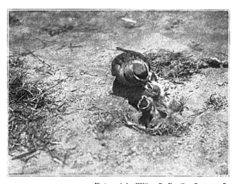
Figure 4. Male Prairie Horned Lark Feeding Young.