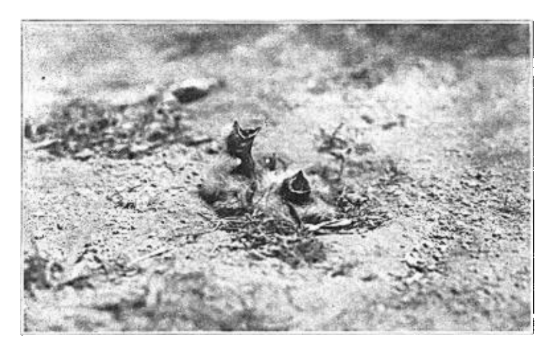
Figure 2. Prairie Horned Lark Nestlings. Note the baldness of the nest-site.