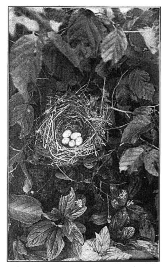
Cedar Waxwing nest. Lake Co., Ill.