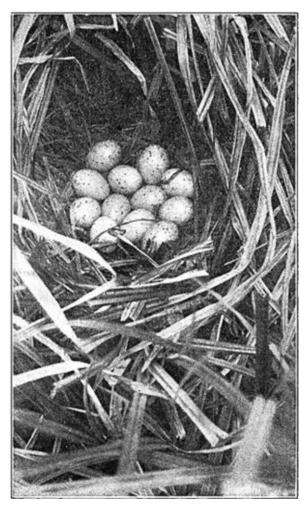
King Rail nest. Lake Co., Ill.