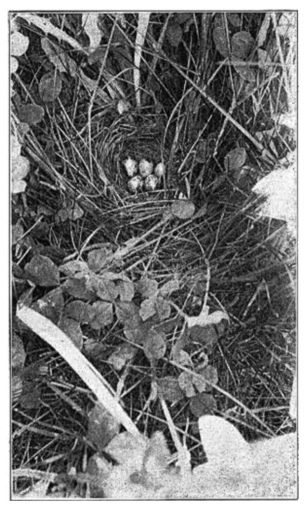
Bobolink nest. Lake Co., Ill.