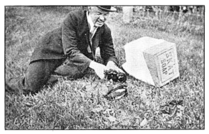
"The little black and white imps." Young Magpies.

I got out to explore a little swampy tract. Wilson's Phalaropes galore and Red-winged Blackbirds with many nests. All of a sudden back of me a loud "clock." I swung around and there sat a beautiful male Yellow-headed Blackbird. I hastened to watch him and saw him disappear to the east along the big irrigation ditch. Just when I was getting ready to follow him Rev. Wichmann sang out: "A Magpie's nest" and sure enough in a cottonwood tree was the big structure with five young Magpies. What a time we had to photograph those little black and white imps and how the old ones came and protested against our actions till a well directed