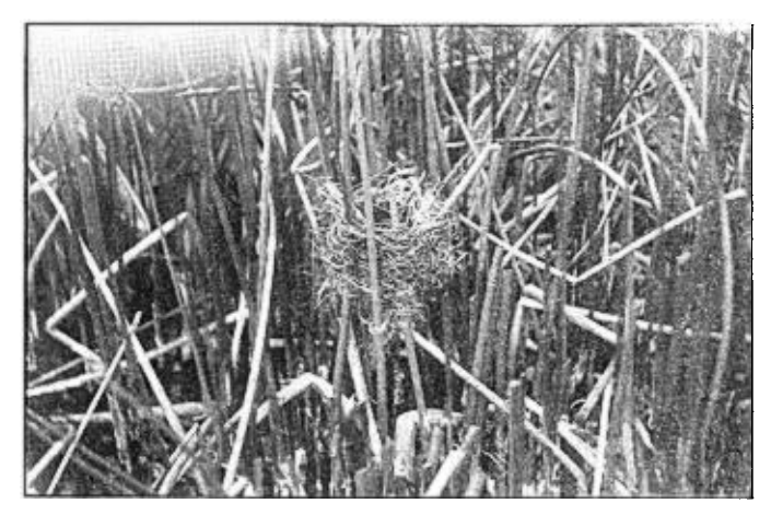
Nest of Yellow-headed Blackbird. Laramie, Wyo., June 6, 1914.

Sunday I enjoyed an automobile trip to the State Fish Hatchery and of course was not surprised to find a Kingfisher there watching the brook trout with a covetous eye. Monday in a drizzling rain I concluded to try some of the swampy places almost within the city limits. Ringbilled Gulls, Mallards and an occasional Crow were flying over the river and at the first small pond I saw a fine female of the Wilson's Phalarope standing with head erect displaying its beautiful colors. A little farther on among a number of Red-winged