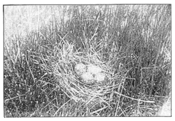
Nest and eggs of Wilson's Phalarope. Carroll Lakes, Wyo., June 12, 1914.

May 30th found us on the road towards the Laramie Mountains. This was the warmest day I experienced, the