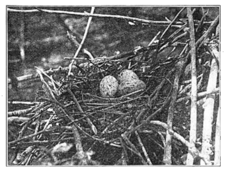
NEST AND EGGS OF WHITE IBIS

Next morning as the first light of dawn tinged the eastern sky a pair of Sandhill Cranes began whooping on a little pond scarcely a quarter of a mile away, an old Turkey Gobbler struck up his mating call down the open glade that lay between us and the cypress swamp, the thousands of young Wood Ibis and other nestlings set up their insistent clamor for food, which did not hush nor diminish until the sun was high in the heavens, and then I realized that here