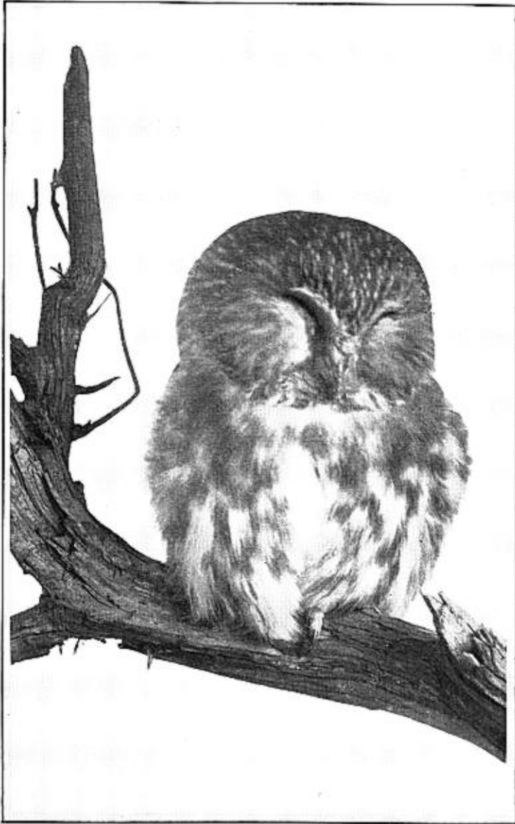
SAW-WHET OWL ( CRYPTOGLAUX A. ARCADIA) Reduced.