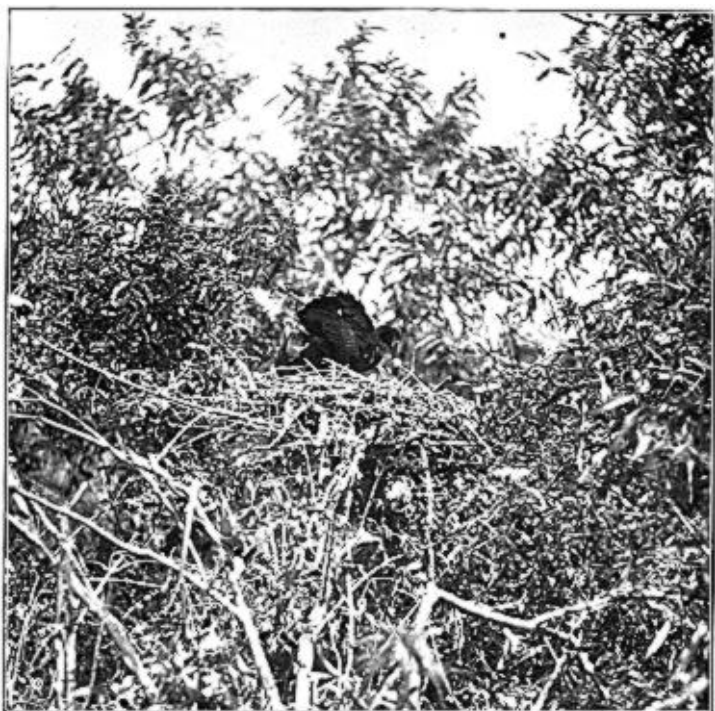
Glossy Ibis feeding young.