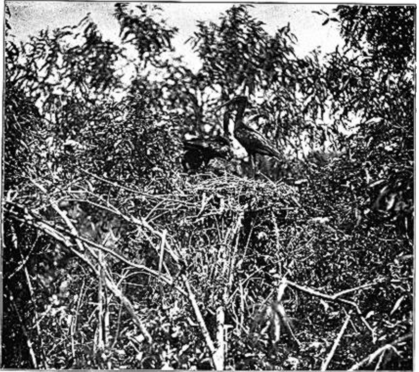
Adult Glossy Ibis ( Plegadis autumnalis ) and four young on nest. The reward of 22 days' continuous waiting.