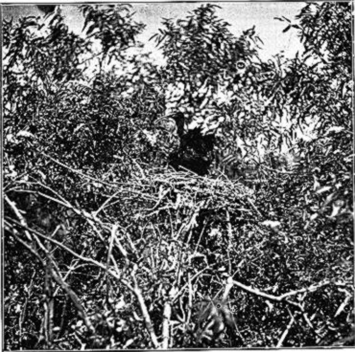
Glossy Ibis shielding young from sun.