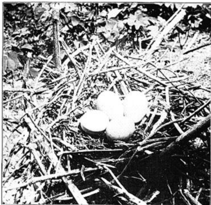
Glossy Ibis ( Plegadis autumnalis ), nest and eggs in situ.