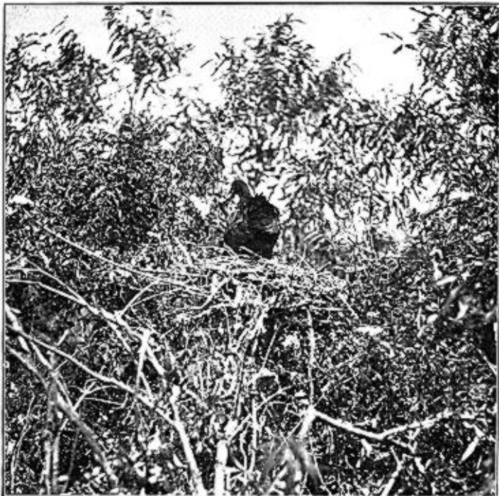
Glossy Ibis feeding young. Shows the orange patch on head of young.