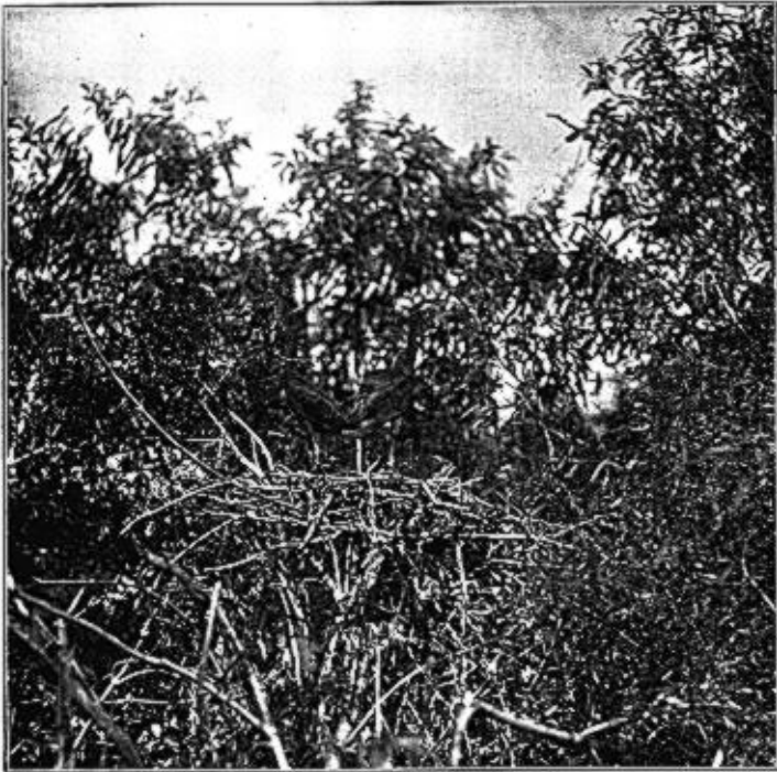
Young Glossy Ibis. To show the white patch on the throat.