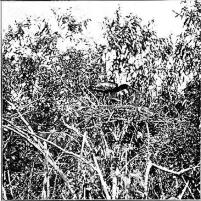
Glossy Ibis building.