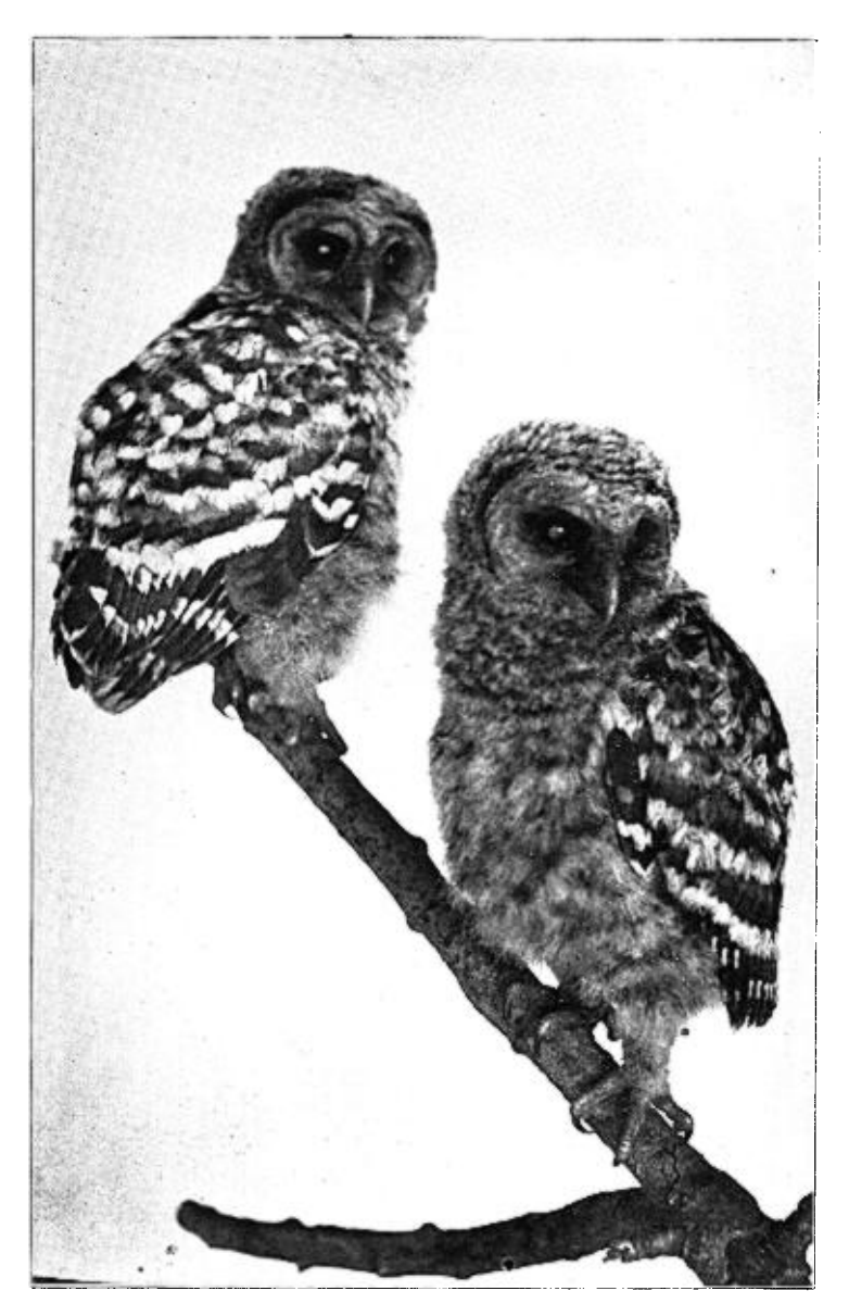
Fig. 1. Nestlings of the Barred Owl (Syrnium varium) at the time of leaving the nest.