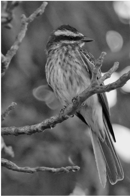
Figure 1. Variegated Flycatcher at Windust Park, Franklin County, Washington, on 7 September 2008. Note the juvenile outer rectrix projecting outward.

and October, three for March and April (Pranty et al. 2008). The Streaked Flycatcher is a migratory species that ranges from northeastern Mexico to Argentina (Howell and Webb 1995), and the Crowned Slaty Flycatcher is an austral migrant that breeds south of the Amazon River from eastern Brazil and northern Bolivia to central Argentina and Uruguay and winters north to southern Venezuela and Colombia (Hilty 2003). The Streaked Flycatcher has yet to be recorded north of Mexico, but a Crowned Slaty Flycatcher was collected in Cameron Parish, Louisiana, on 3 June 2008 (Conover and Myers 2009).