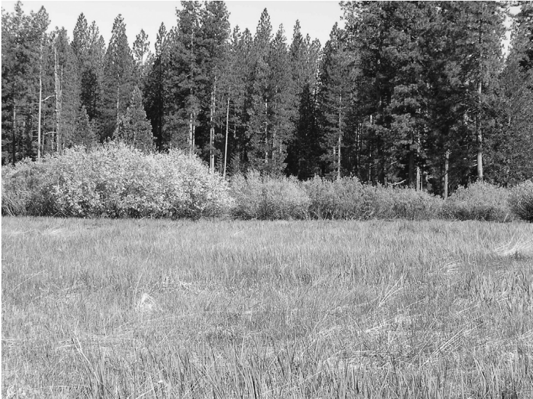
Figure 2. Potential Willow Flycatcher nesting habitat at Ackerson Meadow, just outside Yosemite National Park.

Bombay et al. (2000) reviewed the Willow Flycatcher's nesting habitats in the Sierra Nevada. The species nests most typically in willow thickets in or adjacent to low- and mid-elevation meadows or riparian stringers covering at least 0.4 ha, usually considerably more (Figure 2). Nests have also been found in willow thickets adjacent to lakes, marshes, and creeks. Less frequently, Willow Flycatchers have nested in patches of riparian deciduous shrubs other than willows. Nesting areas, at least in the early part of the breeding season, generally are characterized by extensive surface water (Harris et al. 1988, Sanders and Flett 1989, but see also McCreedy and Heath 2004) and substantial openings, either large and continuous or small and numerous, in the forest canopy. The micro-site used for nesting is typically a patch of shrubs 2–4 m tall, with a high density of leaves (Sanders and Flett 1989, Bombay 1999). Historical records from the Yosemite area suggest Willow Flycatchers bred commonly in the park below 1525 m and less frequently at higher elevations (Gaines 1992). The highest recorded breeding pairs in the park were observed at around 2150 m (Gaines 1992), consistent with Bombay's (1999) suggestion that the upper elevation limit of breeding habitat is determined by the presence of snow and leafless willows at the time of spring arrival.