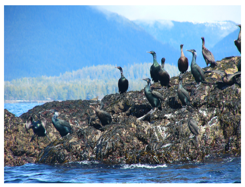
Figure 2. Seven Brandt's Cormorants ( Phalacrocorax penicillatus ) and seven Pelagic Cormorants ( P. pelagicus ) at Black Rock, Revillagigedo Channel, in southeast Alaska, 21 April 2006.

Our records show that the Brandt's Cormorant is clearly a regular winter visitant in small numbers to the Ketchikan area, extending the known winter range of this species north to the southernmost waters of southeast Alaska. In addition, our observations provide Alaska's only winter records, and we found no evidence to suggest that this species winters north to Prince William Sound (contra AOU 1983, AOU 1998, Wallace and Wallace 1998). The Brandt's Cormorant is an uncommon winter visitant and rare spring and fall visitant to the nearby northern Queen Charlotte Islands of British Columbia, where it has been found at Langara and Graham islands (P. Hamel in litt.). High counts there include 50 in Masset Inlet on 14 April 1935 (Campbell et al. 1990), 28 near Masset on 18 December 1982, and 21 in Skidegate Inlet on 26 July 1997 (P. Hamel in litt.). Small numbers were also recorded in 19 of the 25 most recent years on the Masset Christmas Bird Count. Thus the Brandt's Cormorant has probably been a regular winter visitant to the Dixon Entrance area for some time.