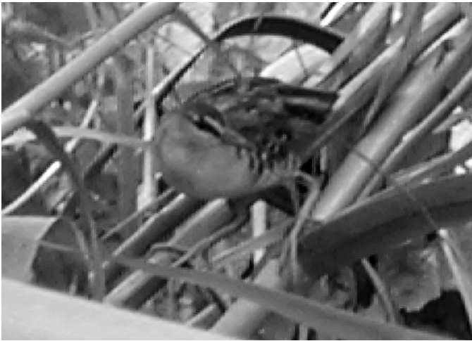
Figure 1. Yellow-breasted Crake at Laguna de Chiricahueto, Sinaloa, Mexico, 15 February 2004.

Purple Gallinule ( Porphyryla martinica ). We observed this species on 15 occasions between 11 December 2002 and 14 May 2004 in Ensenada Pabellones, finding it in rivers, agricultural canals, and within the bay, associated with aquatic and emergent vegetation. Our maximum tally was of five individuals. Our record is about 200 km north of the northern range limit for the species mapped by Howell and Webb (1995),