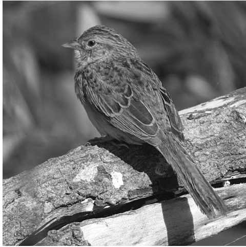
Figure 13. This Cassin's Sparrow ( Aimophila cassinii ) was photographed 17 September 2004 at Stinson Beach, Marin County. Note the fine streaking on the crown and nape and delicate barring on the rump and central rectrices, which are diagnostic for the species.