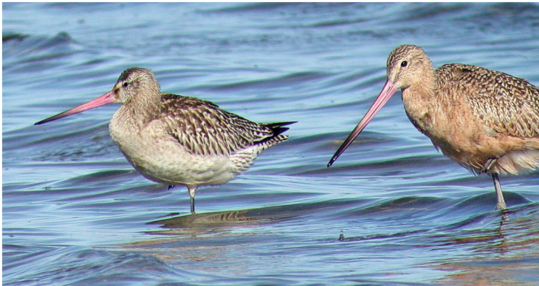
Figure 6. This juvenile Bar-tailed Godwit ( Limosa lapponica ) was with a Marbled Godwit ( L. fedoa ) at the mouth of the Eel River, Humboldt County, 6 October 2004.

ORIENTAL TURTLE-DOVE Streptopelia orientalis (2, 1). One at Furnace Cr.