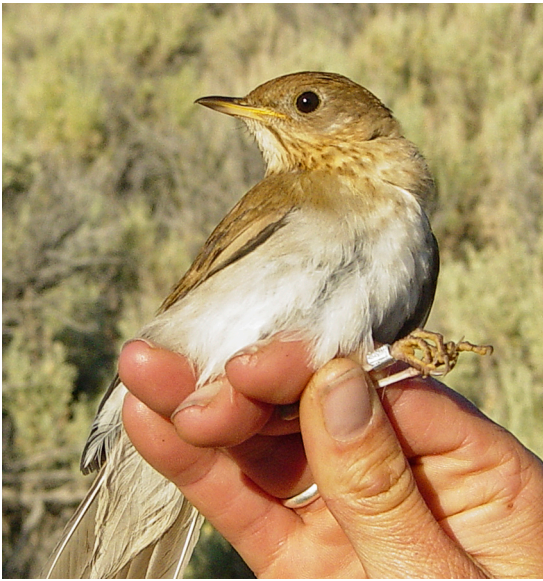
Figure 9. This Veery ( Catharus fuscescens ) was mist-netted and banded 19 June 2004 on lower Rush Creek, Mono County. Note the grayish-white flanks, pale spotting limited to the upper breast, brownish lores and lack of an eyering.