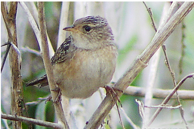
Figure 8. This Sedge Wren ( Cistothorus platensis ) was observed 13 October 2004 at the Goleta sewage ponds in Goleta, Santa Barbara County. The pale, streaked cap and indistinct supercilium help distinguish this bird from the Marsh Wren ( C. palustris ).