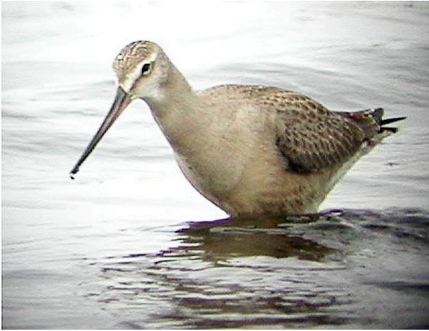
Figure 5. This juvenile Hudsonian Godwit ( Limosa haemastica ) was at Abbott's Lagoon, Marin County, 8 August 2004.