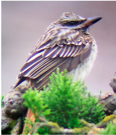
Figure 7. Although the pale basal half of the mandible seen in this bird suggests the Streaked Flycatcher ( Myiodynastes maculatus ), bill coloration is not a definitive field mark. The broad, blackish malar, dark chin, and other plumage features confirm this bird's identification instead as a Sulphur-bellied Flycatcher ( M. luteiventris ), photographed 1 October 2004 at Southeast Farallon I., San Francisco County.