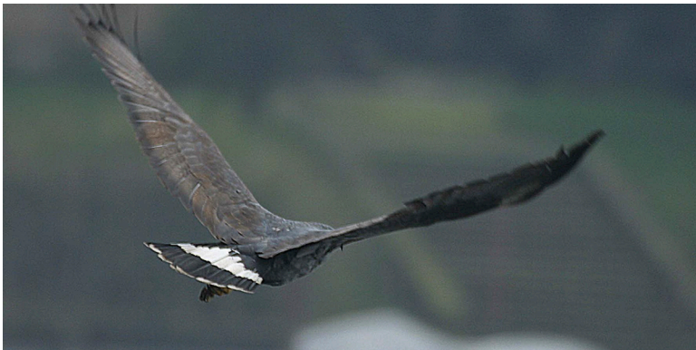
Figure 4. This Common Black-Hawk ( Buteogallus anthracinus ), northern California's first and just the third for California, returned for a second winter to Lake Lincoln, Stockton, San Joaquin County, photographed here 30 January 2005.

LONG-BILLED MURRELET Brachyramphus perdx (17, 3). One was seen from