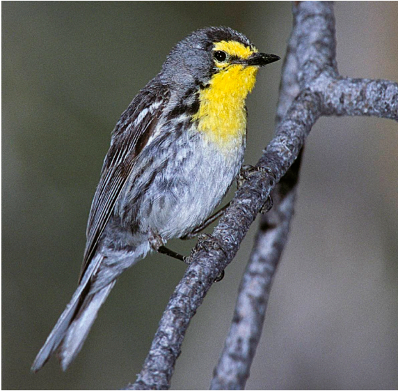
Figure 11. This male Grace's Warbler ( Dendroica graciae ) was photographed 13 June 2004 at the Chimney Creek Recreation Area campground, Tulare County.