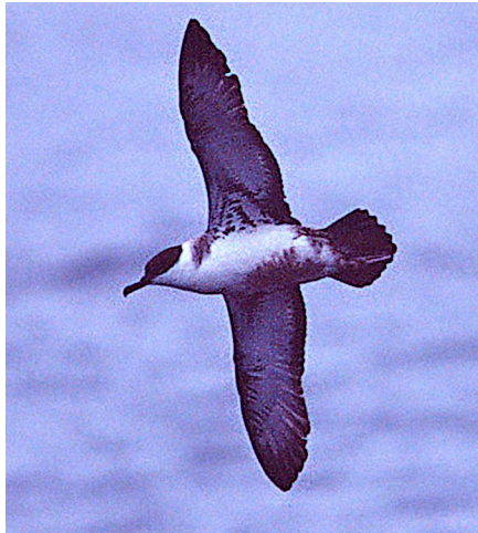
Figure 2. Only the fifth recorded in California waters, this Greater Shearwater ( Puffinus gravis ) was just 8 miles from Bodega Head, Sonoma County, on 29 August 2004.