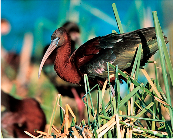
Figure 3. This first Glossy Ibis ( Plegadis falcinellus ) recorded in the San Joaquin Valley was photographed 29 May 2004 at Sutter N.W.R., Sutter County.