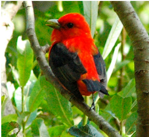
Figure 12. This male Scarlet Tanager ( Piranga olivacea ) was enjoyed by observers 11 June 2004 at San Bruno Mountain State and County Park, San Mateo County. Note the fresher, blacker adult wing coverts contrasting with the older, worn and grayish remiges, indicating this bird was one year old.