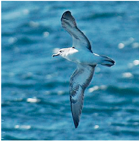
Figure 1. This Streaked Shearwater ( Calonectris leucomelas ) was 15 miles off Bodega Head, Sonoma County, 17 September 2004.