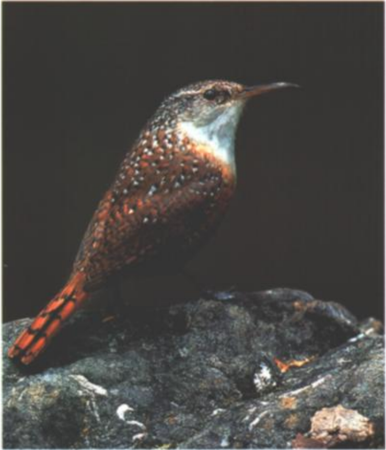
Canyon Wren ( Catherpes mexicanus ), San Jose, California, April 2000.